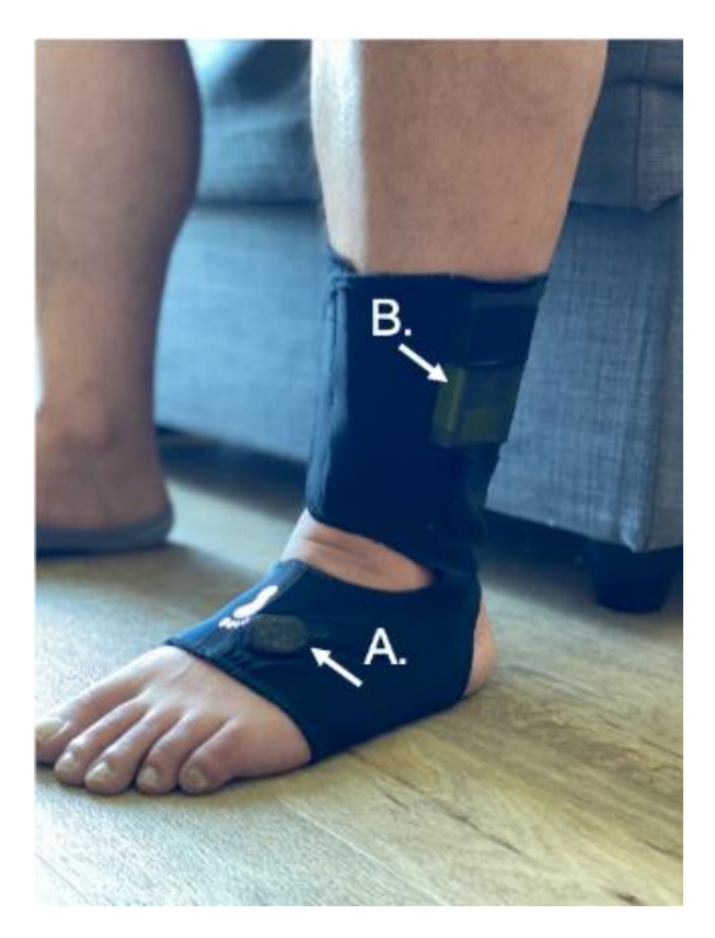
Figure 1. Participant wearing an instrumented sock, APDM prototype. The inertial sensor is located on top of the foot ( A ), and the main unit containing the battery in the socks is located in a second pocket just above the lateral malleolus ( B ). To maximize fit, the socks come in different sizes, and the Velcro attachment around the foot and ankle is adjustable to ensure a snug fit and that the sensor does not move on the foot while being worn.

During a baseline visit to the clinic, participants learned how to wear the instrumented socks on each foot and one Opal sensor over the lower lumbar area with an elastic belt for continuous monitoring of mobility. They were instructed to wear the sensors for at least 8 h/day and then take them off to charge each night for a week. Raw data were stored in the 8 GB internal memory of the sensors and uploaded to a secure cloud-based database server for analysis after being mailed back to investigators.