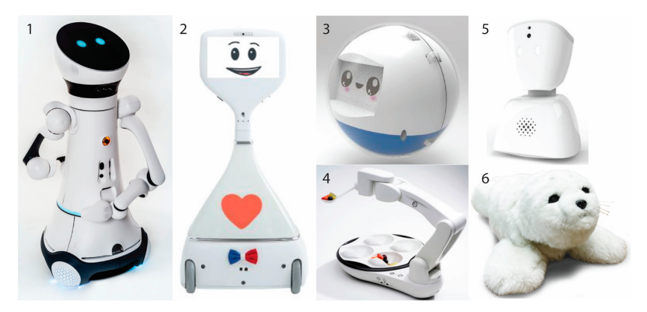
Figure 1. Assistive robots available in the market. (1) Care-O-bot; domestic robot assistant, (2) Cutii; telepresence robot for older people, (3) Leka; a therapeutic robot for children with developmental disorders, (4) Obi; robotic feeding device, (5) AV1; robotic avatar for users with long-term conditions, (6) Paro; therapeutic robot.

The assistive robotic market is different from any software or hardware application, or even other AR technologies. Manufacturing or agricultural robots have required a focus on the design of the mechatronic structure. Aerial, marine and transportation robots have focused on autonomous navigation and object detection. On the other hand, assistive robots build around the nascent human–robot interaction field [38]. They are robots that interact physically with their user, continuously and autonomously monitoring their condition, while supporting them in different activities. The design involves different stakeholders, different structural systems abilities and technologies, different design processes, and different testing methodologies, and as a result, it produces different market barriers for the suppliers of this emerging industry [37–39].