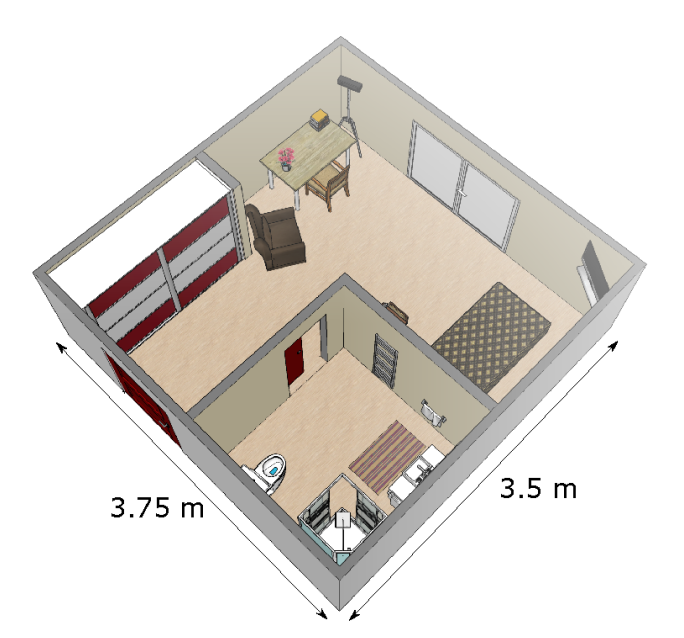
Figure 1. Representation of a typical patient's room. The sensor was positioned in the corner at the top of the figure.

The patients in rehabilitation were living in their own apartment. All apartments were similar to one another, and all were single room apartments. We positioned a Microsoft Kinect sensor v2 (which is a time-of-fligth 3D sensor that produces depth images [24]) in the corner of the room, with a tilt angle of about 20°. That way, all furnitures (bed, desk, chair, armchair) as well as the different doors leading to the exit (i.e., to the corridor of the institute) and to the bathroom were in the field of view of the sensor (see Figure 1). For each patient, the monitoring lasted eight hours, from 9:30 a.m. to 5:30 p.m. Patients went about their usual daily activities, without any specific instructions.