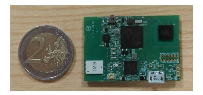
Figure 2. Hardware platform used for data collection.