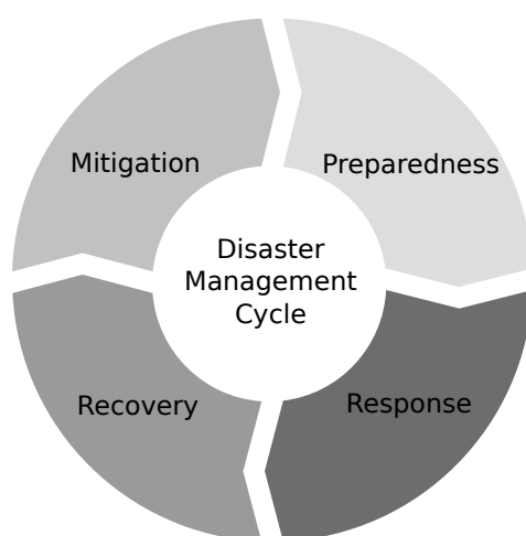
Figure 1. The DM cycle. Mitigation and Preparedness occur before the disaster indeed, while Response is immediately before and after it. Recovery always happens after the occurrence of a disaster. Note that the DM cycle tends to make affected regions better prepared when another disaster strikes.

When it comes to in situ tasks involving DM, there are different options, including rescue team incursions by land, air, or water. Still, affected regions can be dangerous for the rescue team—e.g., 9/11 terrorist attack or the Fukushima Daiichi nuclear accident, where first-responders heroically gave their lives to save others. These situations are examples where disaster robots can play a crucial role, keeping the rescue team safe or even freeing them to execute other tasks.