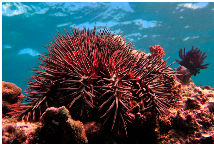
Figure 1. Adult crown-of-thorns starfish are defended against predators by numerous long, very sharp and toxic spines. Photographic credit: Scott Ling, Dick's Reef, Swains Region, southern Great Barrier Reef (22°18' S, 152°39' E).

While there is now general acceptance that CoTS are vulnerable to predation (e.g., [11,21]), on-going controversies relate to whether known predators would ever be capable of regulating CoTS populations, and mitigating, if not preventing outbreaks. More specifically, attention is focussed on whether anthropogenic impacts (via fishing or habitat degradation) have suppressed the abundance of key predators, thereby accounting for the seemingly recent and/or increasing occurrence of CoTS outbreaks [10].