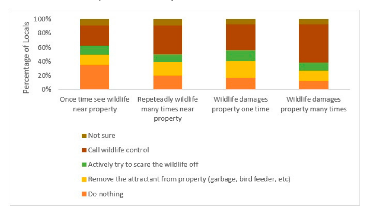
Figure 1. Attitudes toward wildlife on property among locals.

of statements were designed to draw out attitudes toward wildlife that are present and cause damage to local people's properties (Figure 1), further affecting the acceptability of management methods (Figure 2).