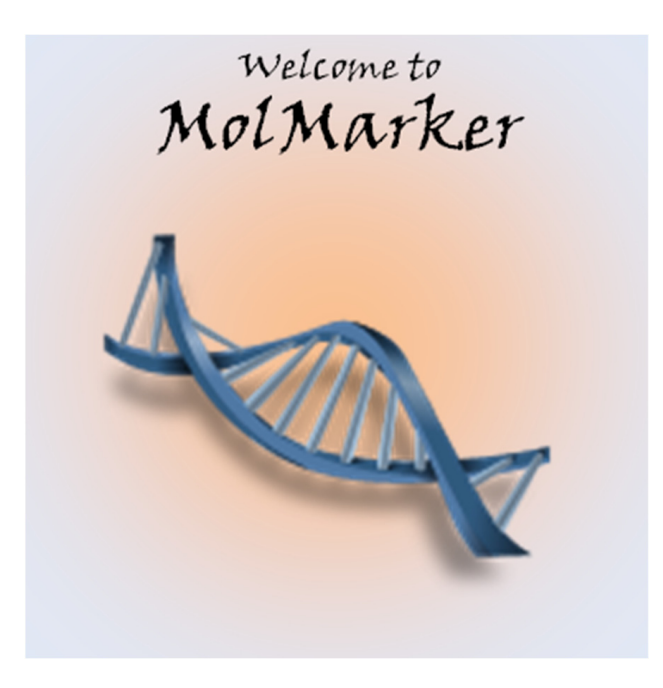
Figure 1. The MolMarker welcome screen.