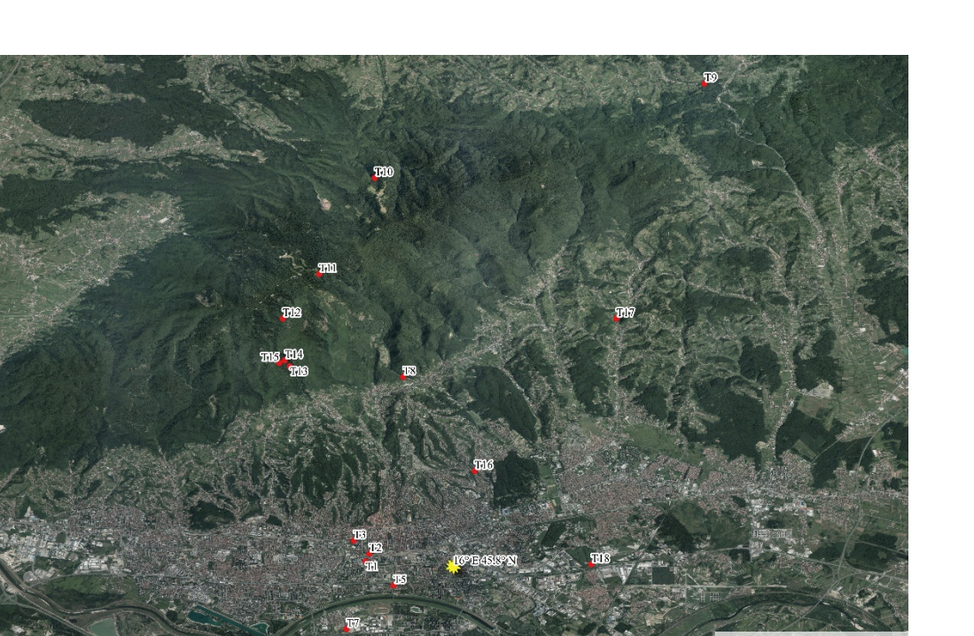
Figure 1. Sampling locations of E. annuus populations in the area of Zagreb and Medvednica Mt. Croatia.