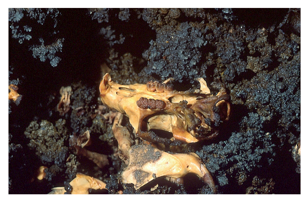
Figure 21. Skull and other subfossil remains of the Tenerife giant rat found in Sobrado Inferior.