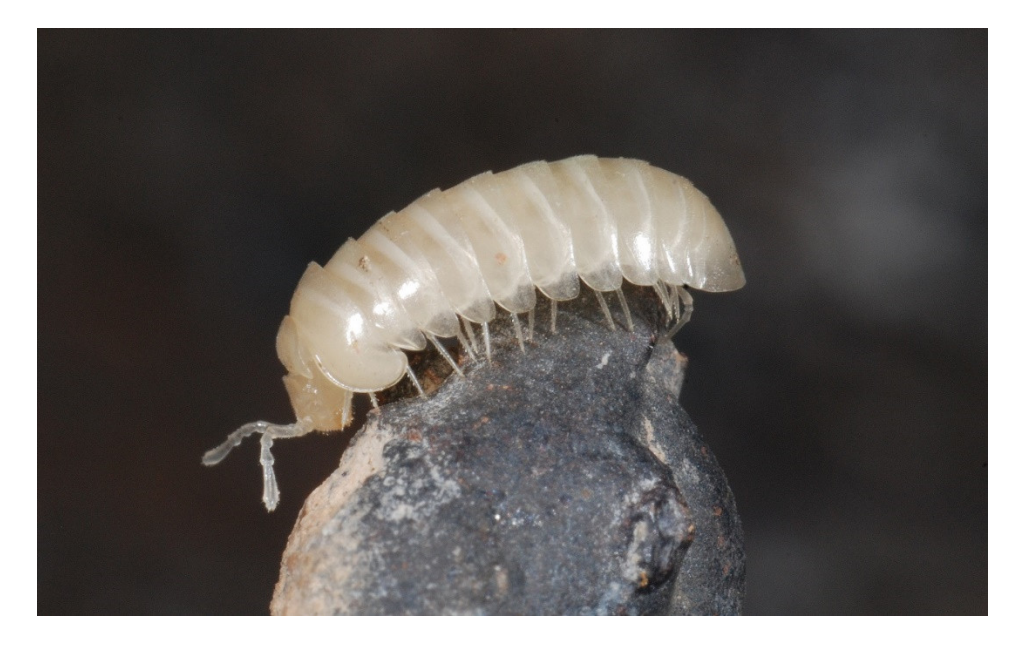
Figure 12. The eyeless Glomeris speobia is the only troglobiotic millipede so far known in the Canary Islands.

is exclusive to Cueva de Felipe Reventón [55]. The highly diversified spider genus Dys dera is represented by five species occurring in both caves, one of them ( D. unguimmanis ) highly troglomorphic and probably parthenogenetic, since no males have ever been found (Figure 16). Each one has a different epigean sister species, so they originated by five independent colonization events of the underground environment [56]. Among troglobiotic web spiders Troglohyphantes oromii is the most abundant (Figure 17), not only in these two caves but in the rest of the island except in Anaga; a similar situation is that of the widespread centipede Lithobius speleovulcanus .