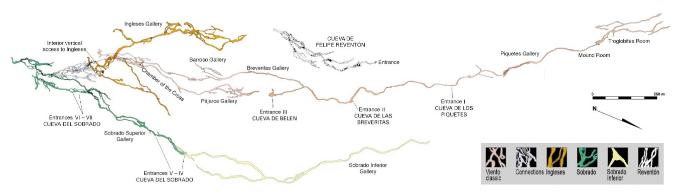
Figure 2. Survey of Cueva del Viento System, with different colors for the main sections, and indication of all accessible entrances. Assemblage partially based on other previously published maps [22,23], with permission. © S. Socorro.

Surveyed: 17.032 m + 1.845 m (Felipe Reventón)