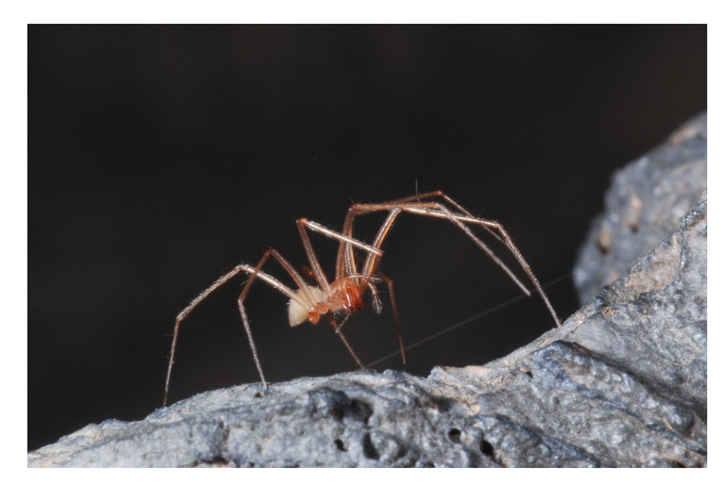
Figure 17. Female of Troglohyphantes oromii , the most abundant spider in Cueva del Viento System.

Besides the subterranean obligate fauna, the shallowness of these caves facilitates the input of trogloxene and subtroglophile animals. Thus, the total number of arthropod species found in them roughly doubles the number of troglobionts [58], but the trogloxenes are almost absent in the deepest levels of Breveritas Superior and Sobrado galleries. Local eutroglophiles are usually widespread species, some introduced like the millipedes Blaniulus guttulatus and Choneiulus subterraneus (Silvestri), and some probably native species like the spider Meta bourneti , the psocid Psyllipsocus ramburii (Selys-Longchamps) and the