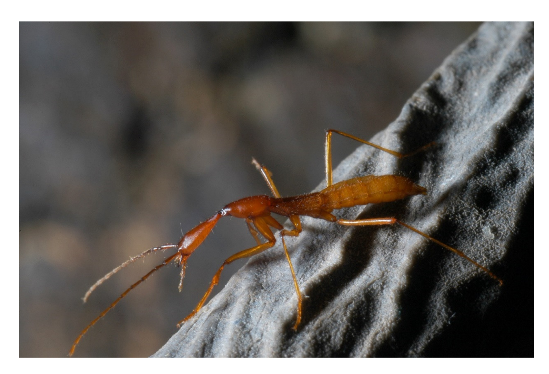
Figure 20. The highly troglomorphic Domene vulcanica is one of the six cave-adapted rove beetles known from these caves.