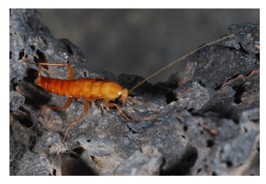
Figure 15. Male of Loboptera troglobia , the most specialized cockroach occurring in many subterranean environments on the island.

All troglobiont ground beetles are eyeless but otherwise not especially troglomorphic (Figure 18); Pterostichinae are medium size beetles in two endemic genera ( Wolltinerfia and Gietopus ), while Trechinae are smaller and are represented by the monospecific endemic genus Spelaeovulcania canariensis and two euedaphomorphic species of Lymnastis (Figure 19). The diversity of subterranean rove beetles is remarkable, both in the Canary Islands (27 spp.) and in Icod caves (6 spp.) [57], and they are usually more troglomorphic than ground beetles, as shown by the marked elongation of body and appendages in Domene alticola and D. vulcanica (Figure 20).