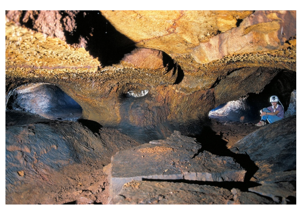
Figure 6. Network of conduits with smooth surface formed by very fluid lava in Cueva de Felipe Reventón. Foreground: last blocks fallen from the roof after the eruption.