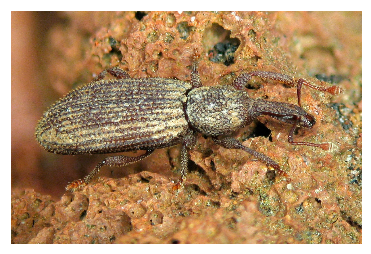
Figure 11. Oromia hephaestos is a scarce weevil known only from the Cueva del Viento System.

Detritivores are more varied than root-feeding species, but due to the broad spectrum of feeding behavior necessary to survive in the cave, it is often difficult to know the preferences of each millipede, woodlouse, springtail or cockroach. The pill-millipede Glomeris speobia and the woodlouse Venezillo tenerifensis are among the most widespread troglobionts on the island and are regularly seen in both the Icod caves discussed here (Figures 12 and 13). The millipede genus Dolichoiulus is a paradigm of island radiation with 21 endemic species to Tenerife, three of them troglobionts [51] (Figure 14); Dolichoiulus labradae and D. ypsilon are becoming rarer in these caves, probably due to the increasing abundance of the alien, invasive troglophile Blaniulus guttulatus (F.). The woodlouse Porcellio martini is also scarce, found here and there in other caves of the island. Another woodlouse Trichoniscus bassoti and the springtails Troglopedetes vandeli and T. cavernicolus may not be correctly identified [52,53], since the presence of non-endemic troglobionts on an oceanic island is not conceivable due to their inability to disperse over distances across the sea.