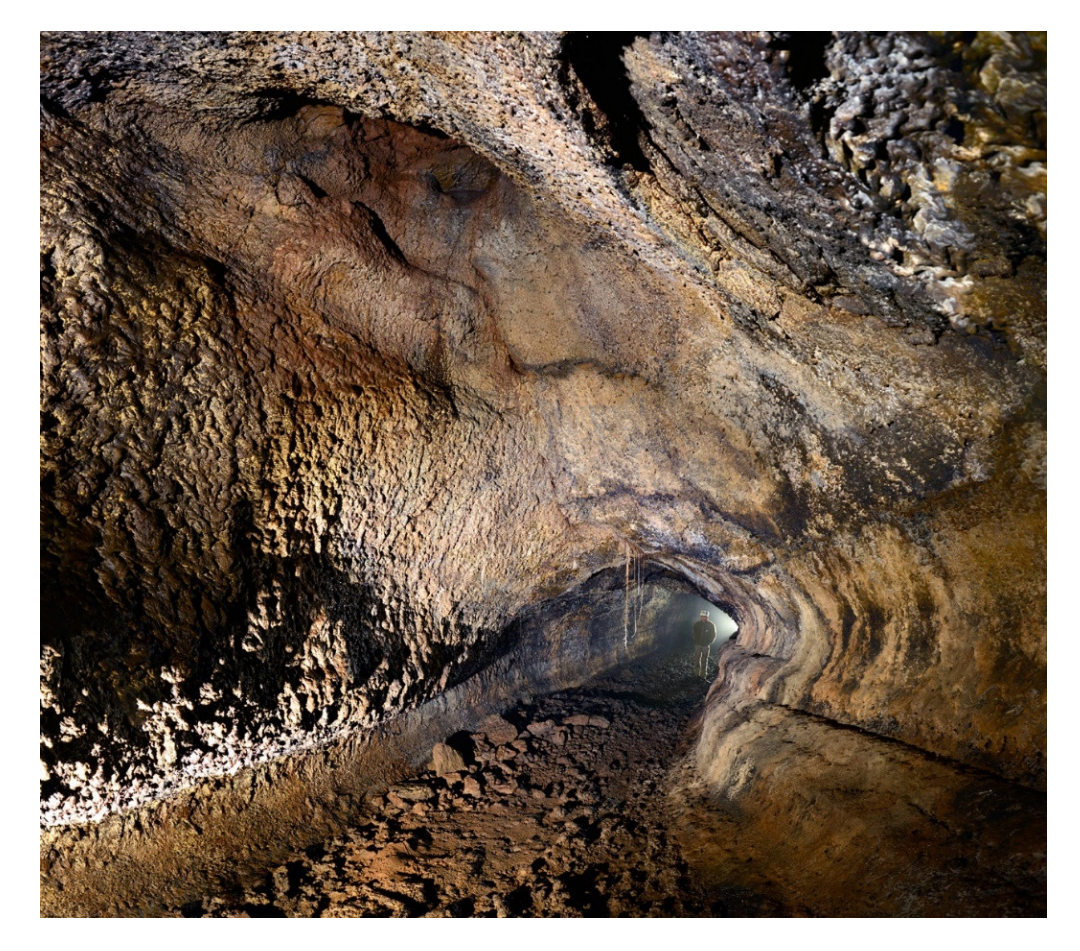
Figure 5. Ceiling with a closure suture of a formerly open lava channel, in Breveritas Gallery. © S. Socorro.

Figure 4. Complex system of tubes at different levels, the highest ones captured by upwards re-excavation and collapses of the ceiling. Ingleses Gallery. © S. Socorro.