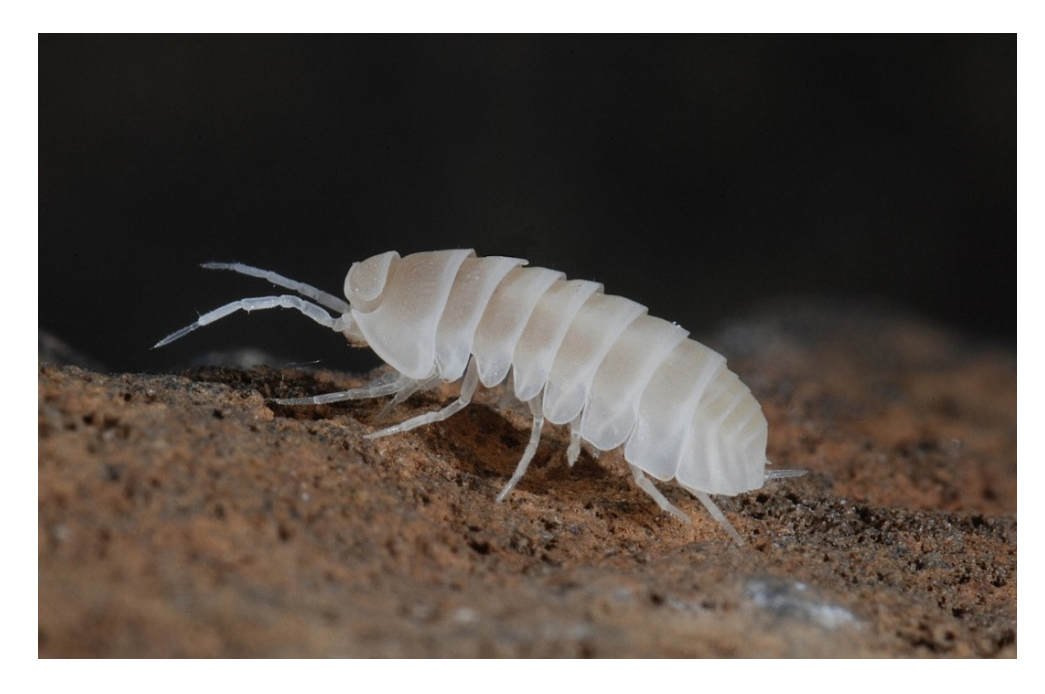
Figure 13. The woodlouse Venezillo tenerifensis is widespread in almost all suitable underground environments on Tenerife.