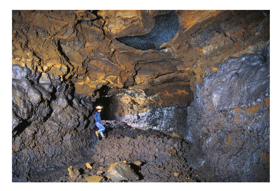
Figure 7. Vitreous black stripe on the walls of Ingleses Gallery. Re-excavation of the ceiling showing the pahoehoe structure. The very last flow stopped and formed a rough step.

In the Sobrado Superior sector, the geomorphological beauty of its galleries and its didactic interest are notable. There are side terraces, multiple levels marked by lava when changing height, effects of centrifugal force on lateral benches, etc. The area called the Labyrinth is an intricate network of interconnected tubes of almost circular section and smooth walls, which can rival the other existing labyrinth in Cueva de Felipe Reventón (Figure 6).