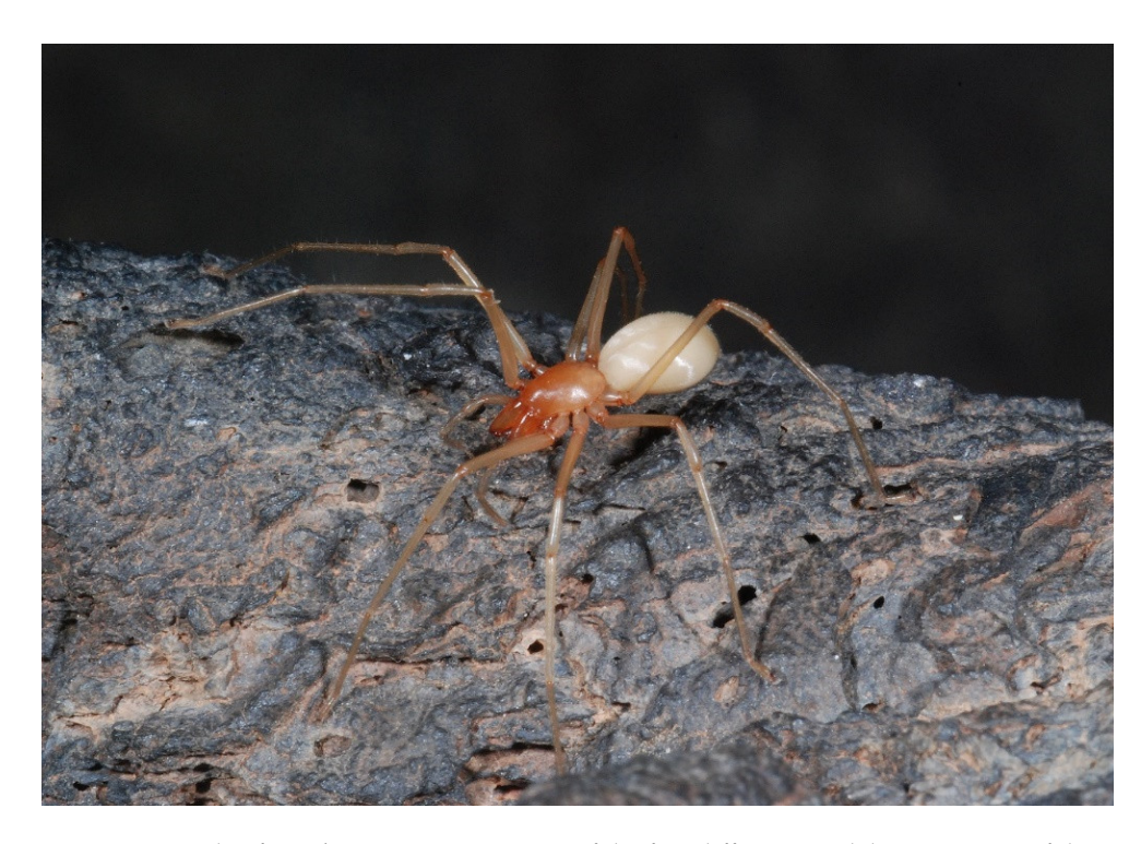
Figure 16. Female of Dysdera unguimmanis , one of the five different troglobiotic species of the genus recorded in these caves.