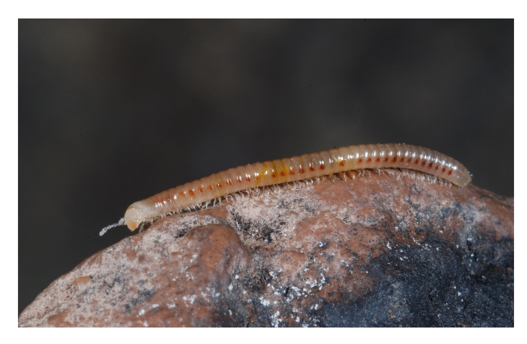
Figure 14. Dolichoiulus ypsilon, one of the two troglobiotic millipede species of the genus occurring in the Icod caves.