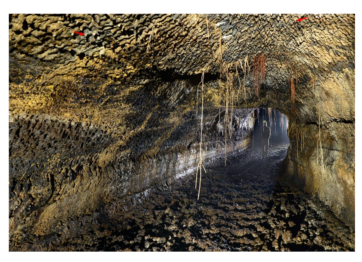
Figure 3. Passage of Cueva del Viento (Breveritas) with the original ceiling evidenced by the abundant small stalactites of lava (red arrows) and with dangling roots (white arrows).

The mapped extent of Cueva de Felipe Reventón is 1845 m so far measured, but the complete survey has never been finished and it is probably something over 3000 m in length [24]. The only entrance to Felipe Reventón is in a public property also belonging to the Cabildo de Tenerife, but most of the upper part of the cave lies under private land with a few houses. This entrance is at 628 m a.s.l. just at the lower end of the cave, and no different sector names are used for partial galleries. It is a rather labyrinthine system of interconnected galleries with a relatively short distance (438 m) between upper and lower extremes (Figure 2), and the internal dimensions are generally somewhat smaller than the main galleries of Cueva del Viento.