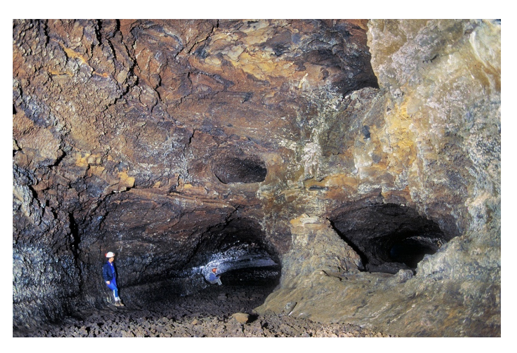
Figure 4. Complex system of tubes at different levels, the highest ones captured by upwards re-excavation and collapses of the ceiling. Ingleses Gallery.