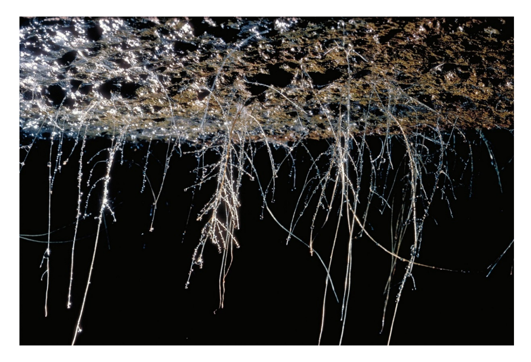
Figure 9. The tender roots hanging from the ceiling are an important input of organic matter.

Besides the main entrances, there are along both caves several partial collapses of the original compact ceiling, facilitating the connection with the overlying soil and sometimes even with the surface. This allows the entry by many trogloxenes (animals not linked to the caves) and subtroglophiles (only linked for part of its life cycle) [41], which form an important resource for predatory species in many parts of the lava tubes, sometimes far from any large entrance. Abundant flying insects can be found in such spots, like the subtroglophile Megaselia scuttle flies that probably are common prey for a diversity of troglobiotic web-spiders, which could not survive only feeding on other troglobionts. In the