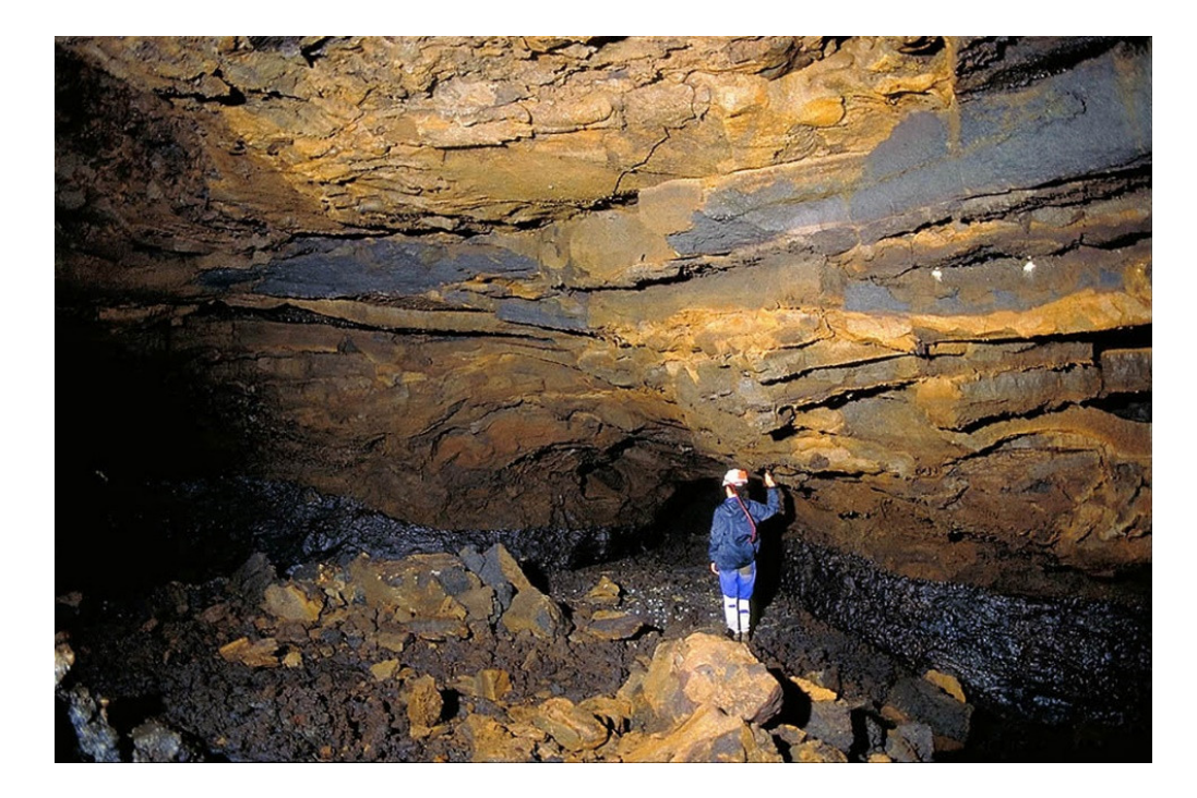
Figure 8. Large re-excavation of the ceiling and walls in the Ingleses Gallery, showing the parallel layers of the pahoehoe flow. Most of the fallen blocks that fell from the roof during the tube formation were swept away by the lava, while the latest to fall stayed in position on the floor.

The spectacular black band that can be seen along the main gallery of Ingleses must have been formed by a pulse of very fluid lava that flooded the conduit to a certain height (Figures 7 and 8). The rapid fall in the lava level left a thin layer that quickly cooled and vitrified in contact with the walls.