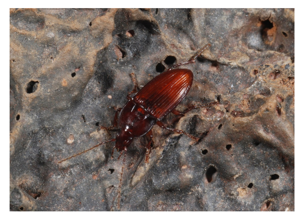
Figure 18. The eyeless ground beetle Gietopus martini belongs to a monospecific genus endemic to Tenerife.

moth Schrankia costaestrigalis . The abundant larvae of the subtroglophile winter crane fly Trichocera maculipennis Meigen capture their preys in sticky silk threads, being important predators in most of the cave communities of Tenerife.