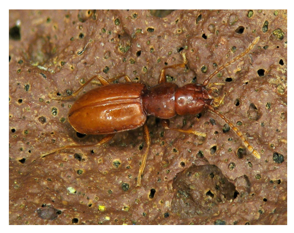
Figure 19. The small ground beetle Spelaeovulcania canariensis has no other related species on the Canary Islands.