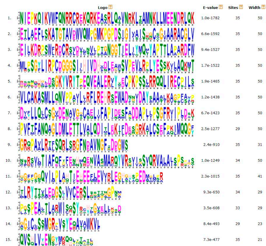
Figure S1. Logo of the conserved motifs of the HD-ZIP III proteins.