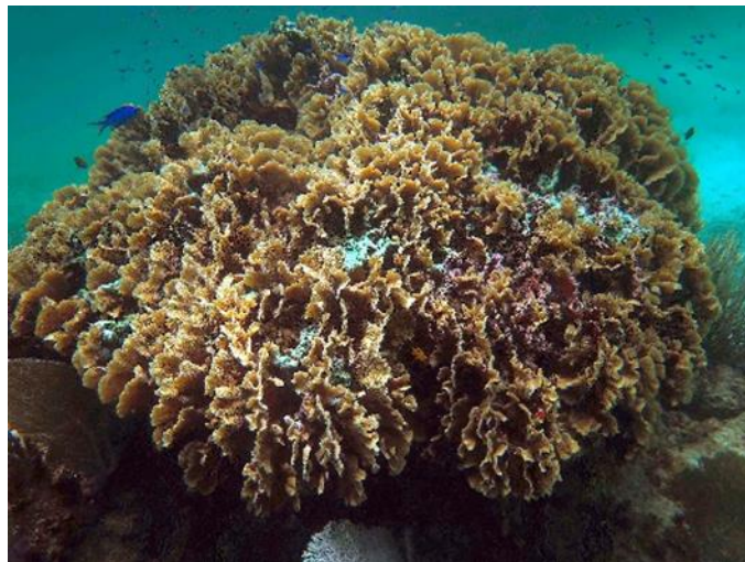
Figure S3: Colonies of Agaricia tenuifolia .