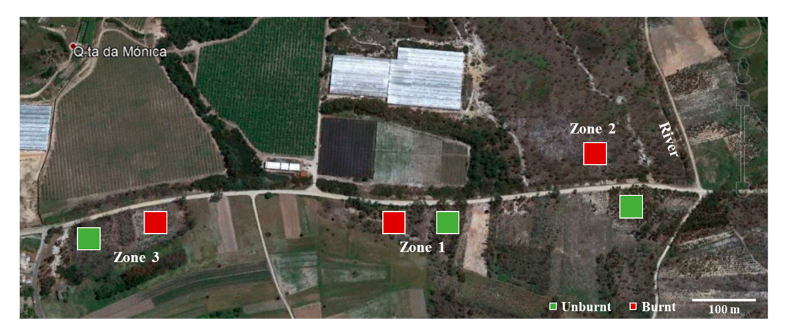
Figure 1. Schematic representation of the location of the six sampled sites: three unburnt zones (green) and three burnt zones (red). The 5 \times 5 m plots were established to collect young plants and nodules.

The study site was an area occupied with forest, including Acacia sp., Eucalyptus sp. and Pinus sp. trees. Six sampling sites were selected, including three unburnt zones or zones were no fire occurred (UBZ) and three burnt zones (BZ) (Figure 1). An area of 25 \text{ m}^2 ( 5 \times 5 \text{ plots} ) was established in each sampled zone, where eight individual young plants (20–60 cm) were selected randomly. Acacia nodules were collected by digging up plants to identify roots with attached nodules. Nodules were counted, their size was measured and then they were stored in silica gel and kept under room temperature until use.