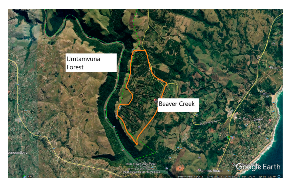
Figure 1. A Google Earth image showing the close proximity of Beaver Creek Coffee plantation to Umtamvuna forest.

The leaves were placed in a reseal-able plastic bag and stored in a cooler box with ice, to keep the mites sessile. The mites were then viewed under a dissecting microscope, on the same day the sampling took place. Mites found inside domatia were counted before they were collected for identification. Mites were removed and collected from leaves using a pipette and a drop of alcohol, mounted on a slide using PVA mounting medium, and viewed under an Olympus light microscope. Some individuals were mounted on a stub, using a double-sided tape, coated with carbon, and viewed under a scanning electron microscope. Mite species abundance (average number of mites per leaf), composition and the Shannon diversity index for both sites were calculated.