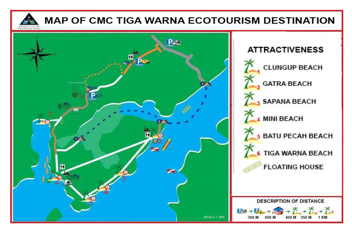
Figure 2. Research location.