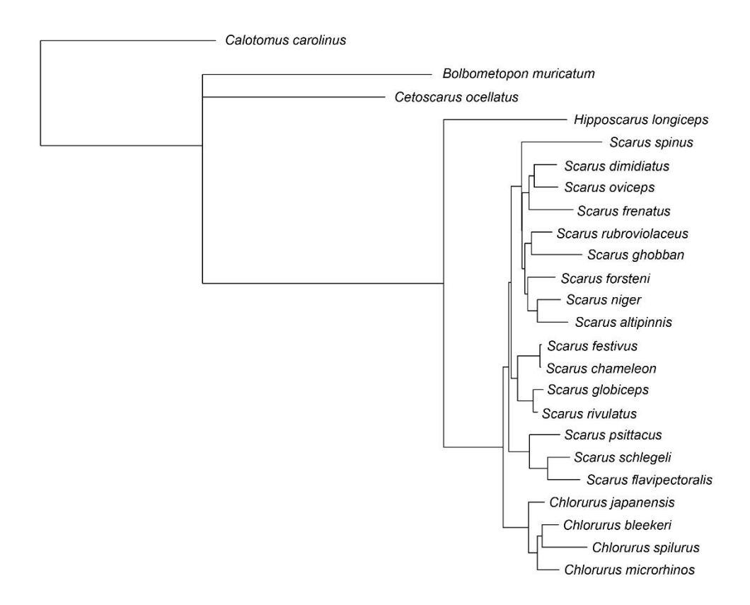
Figure S2. Phylogenetic tree including 24 parrotfish species surveyed across the northern Great Barrier Reef, pruned from Choat et al. (2012; using both mitochondrial and nuclear gene sequences) and used in calculations of phylogenetic diversity.