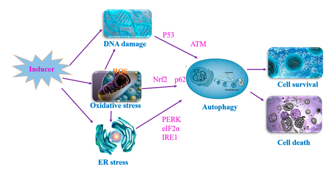
Figure 2. Molecular pathways involved in the regulation of autophagy. Oxidative stress induced DNA damage and ER stress, which caused autophagy development. Autophagy has a dual nature, which can not only save cell survival, but also promote cell death.

Many signaling pathways are known to regulate autophagy under hypoxic and lowenergy conditions. mTORC1 plays a key role by phosphorylating ULK1/2 to regulate autophagy [31]. AMPK is a major player of mTORC1 and promotes autophagy under hypoxic conditions [32]. Additionally, autophagy is induced by oxidative stress, endoplasmic reticulum (ER) stress, and DNA damage to maintain cellular survival (Figure 2).