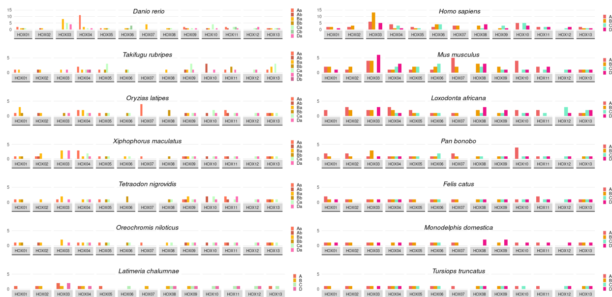
Figure 1. Known transcript numbers along the anterior–posterior axis. Clusters are coded by color, as per right-side legend.