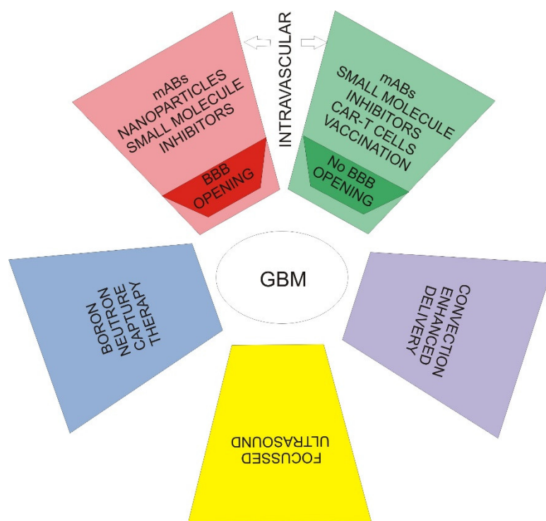
Figure 2. EGFR-based therapies in glioblastoma. (BBB—blood brain barrier, mABs – monoclonal antibodies, CAR-T—Chimeric anti-gen receptor T cell therapy)

non-stem cells that expressed EGFR [104]. In Figure 2, the EGFR-based therapies used in glioblastoma are mentioned.