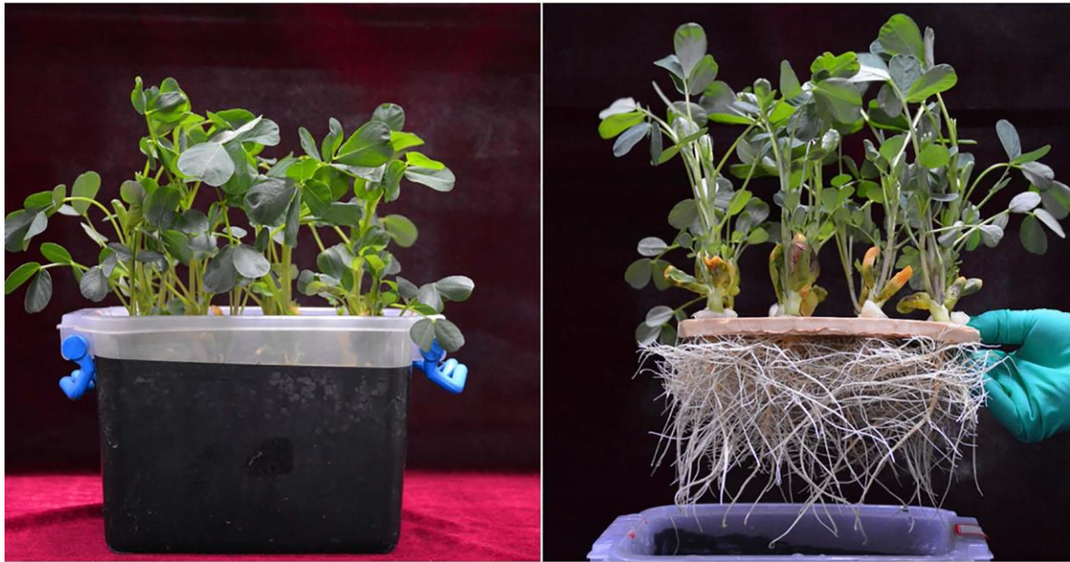
Figure S1. Two-week-old seedlings of H8107 grown on plates cultivated with 1/2 Hoagland solution.