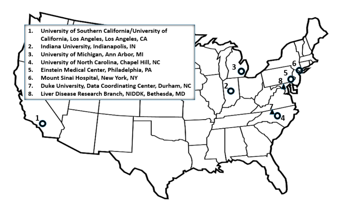
Figure 1. Drug-Induced Liver Injury Network (DILIN) 2015. NIDDK = National Institute of Diabetes and Digestive and Kidney Diseases.

Currently, cases are enrolled from six sites (Figure 1) across the continental U.S. The Los Angeles and North Carolina sites include two large academic centers each, and several sites have outlying satellite clinics expanding their enrollment catchments well beyond their immediate metropolitan areas. All sites are large referral centers for liver disease and transplantation. Each site must go through an entry and then renewal process every five years. The application for entry and renewal is extensive and highly competitive. While there have been site changes over the 12 years, three of the current six sites have remained since inception, and two have been enrolling for more than seven years. Each site maintains institutional review board (IRB) approval at their respective centers. The data coordinating center as well as direct support and oversight by the U.S. National Institute of Diabetes and Digestive and Kidney Diseases (NIDDK) have remained the same since 2004.