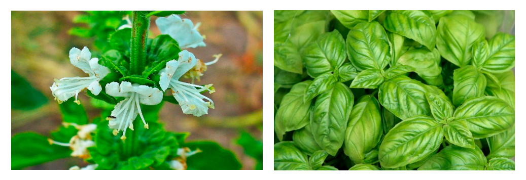
Figure 1. Picture of Ocimum basilicum.