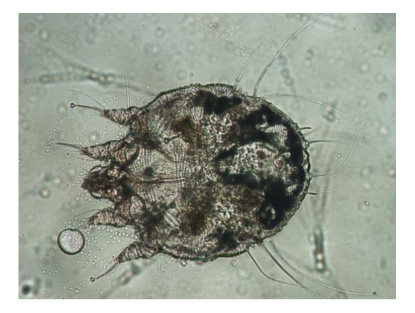
Figure 2. Sarcoptes scabiei visualized under a light microscope.

The Sarcoptes mites used in the experiments were collected from the crusts of naturally infested New Zealand white rabbits in a rabbit farm in Nanning, Guangxi Province, China. Before the beginning of the study, we contacted the farm owners and obtained their permission to have the infected rabbits involved. The study protocol was approved by the ethics committee of Guangxi University (approval no. GXU2019-019). The crusts were placed in petri dishes and transported to the laboratory within a few hours. The Sarcoptes mites (Figure 2) were isolated one by one with a needle for further testing under a stereomicroscope. Six terpenes, namely terpinen-4-ol, citral, linalool, eugenol, geraniol, and carvacrol (Figure 3), were purchased from Shanghai Macklin, Shanghai, China. All of the compounds were of the highest purity available (from 95 to 99%). Benzyl benzoate was obtained from the biochemical company Shanghai Aladdin, Shanghai, China, and used as a positive control.