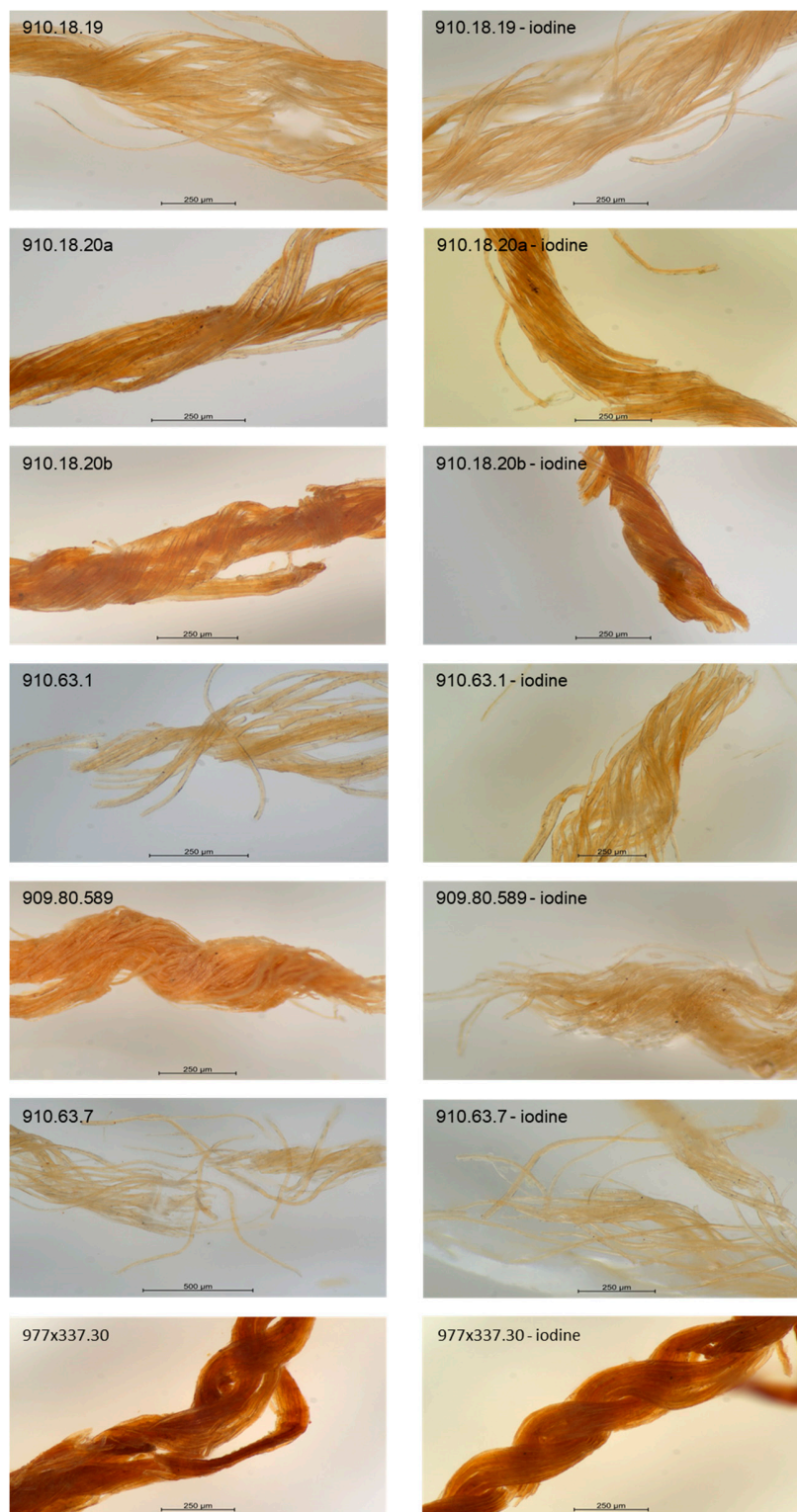
Figure S1. Photomicrographs of threads from each cloth before and after staining with a solution of potassium iodide/iodine 0.1N (Lugol's stain).