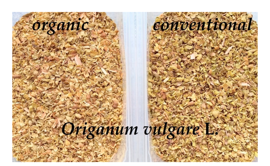
Figure 1. Comparison of colors of dry oregano from organic and conventional cultivation.