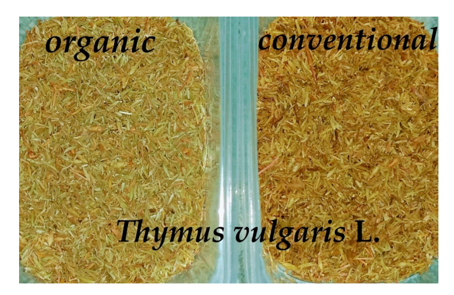
Figure 2. Comparison of colors of dry thyme from organic and conventional cultivation.