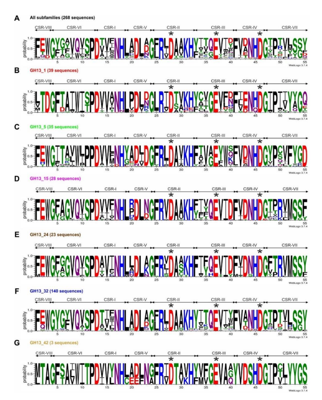
Figure 1. Sequence logos of \alpha -amylases from studied GH13 subfamilies. Logos for ( A ) all the six studied subfamilies (268 sequences); ( B ) subfamily GH13_1 (39 sequences); ( C ) subfamily GH13_5 (35 sequences); ( D ) G13_15 (28 sequences); ( E ) subfamily GH13_24 (23 sequences); ( F ) subfamily GH13_32 (140 sequences); and ( G ) G13_42 (3 sequences). CSR-I, residues 13–18; CSR-II, residues 24–32; CSR-III, residues 33–40; CSR-IV, residues 41–46; CSR-V, residues 19–23; CSR-VI, residues 4–12; CSR-VII, residues 47–55; CSR-VIII, residues 1–3. The catalytic triad, i.e., the catalytic nucleophile (No. 28, aspartic acid in CSR-II), the proton donor (No. 37, glutamic acid in CSR-III) and the transition-state stabilizer (No. 46, aspartic acid in CSR-IV) are indicated by asterisks.

The unique features within the sequence logo for the three fungal GH13 subfamilies GH13_1, GH13_5 and GH13_32 as well as those shared by two of the three subfamilies have already been described in a detail recently [30]. Here, also the subfamily GH13_42, although it currently contains only one putative fungal \alpha -amylase [6], has been added. It is evident that it also exhibits its own unique sequence features, such as positions 1–3 (CSR-VIII) occupied by residues mTA and positions 53–56 (CSR-VII) with the motif YYGS.