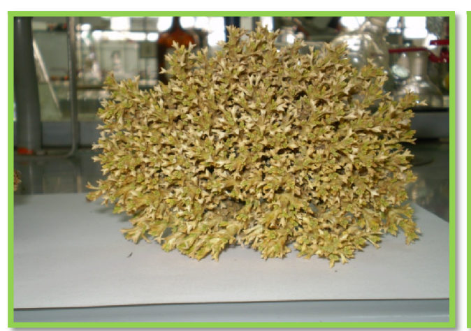
Figure 1. Pictures of Mulinum crassifolium (left) and Azorella compacta (right), from Northern Chile.