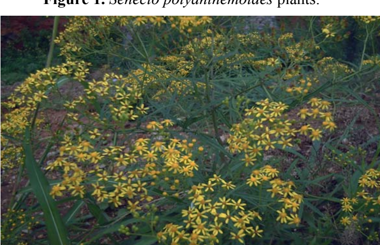
Figure 1. Senecio polyanthemoides plants.

Senecio polyanthemoides Sch. Bip. is a bushy annual herb of about 1.8 m height with a woody stem at the base. The leaves (15 x 4 cm) are lanceolate, petiole-like and pinnately divided with smooth and thinly white-felted upper and lower surfaces respectively. Inflorescences are radiate, with many short bracteates arranged in spreading corymbose panicles and flowers mainly in September and October. S. polyanthemoides grows naturally on forests margins, farmlands and in scattered localities along roadsides in KwaZulu-Natal [16,17].