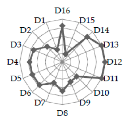
Figure 1. Evaluation Value of the Third Level.

Figure 1 shows that the evaluation value of the external auditor and the predictive value are the lowest, which indirectly verifies the results of the analysis of the importance of attributes. The financial officers think that the predictive value is not important subconsciously, leading to case company accounting information that has little effect on stakeholder prediction. At the same time, we can also see that the third party audit agency hired by the case company does not have a very good practicing quality and qualification level. The evaluation value of the audit opinion type, compliance, and internal control are the highest, because these data are the premise of a company ensuring the quality of financial information and are the stakeholders' minimum requirements for companies. Therefore, the vast majority of companies should reach this level. Moreover, the evaluation value of the confirmatory value, verifiability, importance, and cost-benefit principle is lower, which should cause concern for the financial managers in the case company.