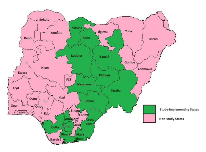
Figure 1. A map of Nigeria showing the study states.