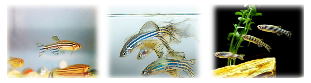
Figure 2. Adult zebrafish illustration.

The zebrafish was described in 1882 by Francis Hamilton, who found it near the Ganges River in India [19]. After George Streisinger first used the zebrafish to study vertebrate development in the 1980s, it became one of the most important laboratory animals with unprecedented speed [8]. The zebrafish is native to most of the Indian subcontinent, from Pakistan in the west through India, Nepal, and Bangladesh to Myanmar in the east. Zebrafish can be found in a wide variety of habitats. The adult zebrafish is 2 to 4 cm long, and its body is characterized by zebra-like stripes (Figure 2).