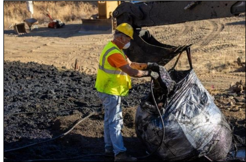
(A) Handling MercLok supersacks for the calcines cap.