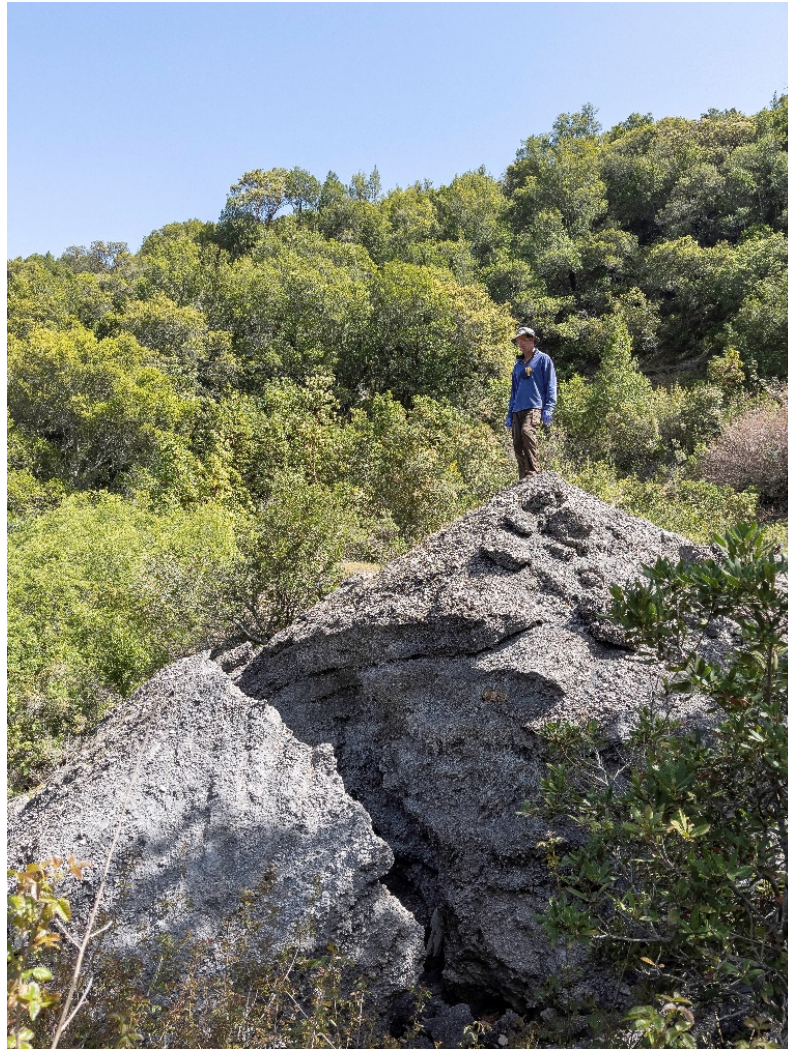
(A) calcines pile hardened and fractured above the stream channel.