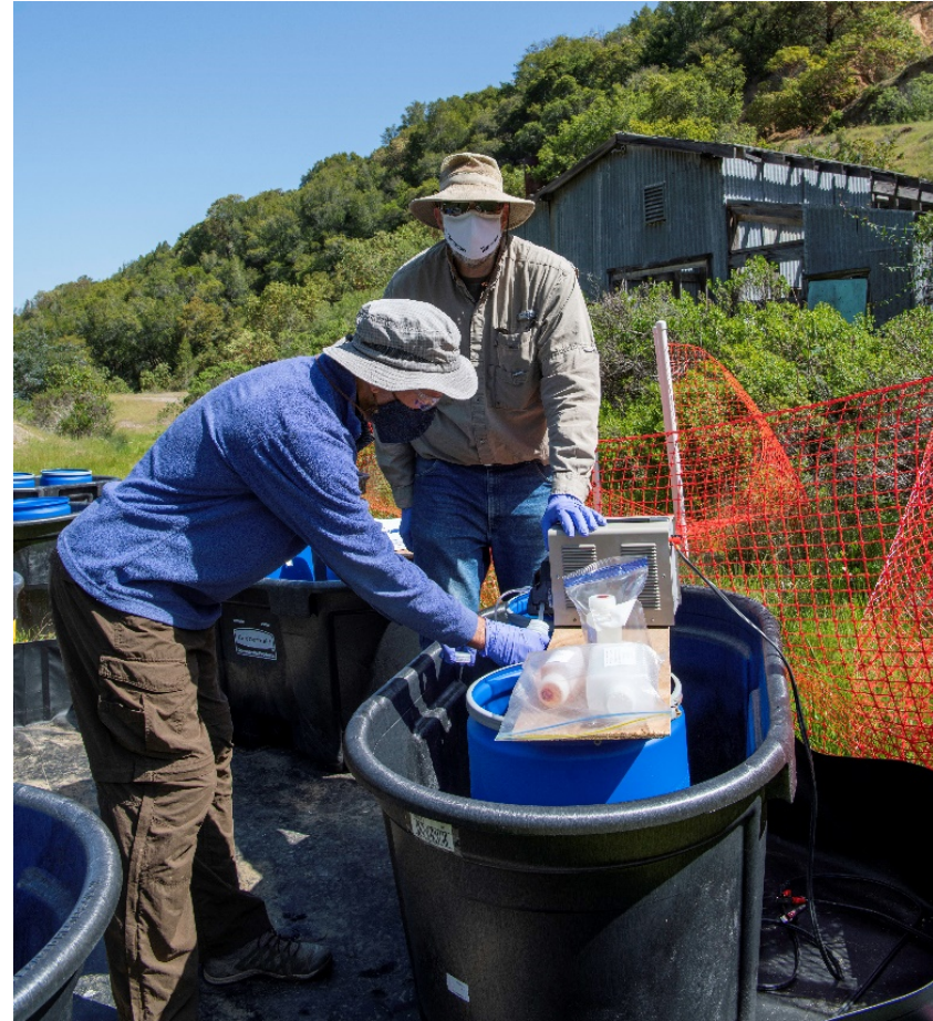
(B) Sampling leachate from test buckets at Site 1.