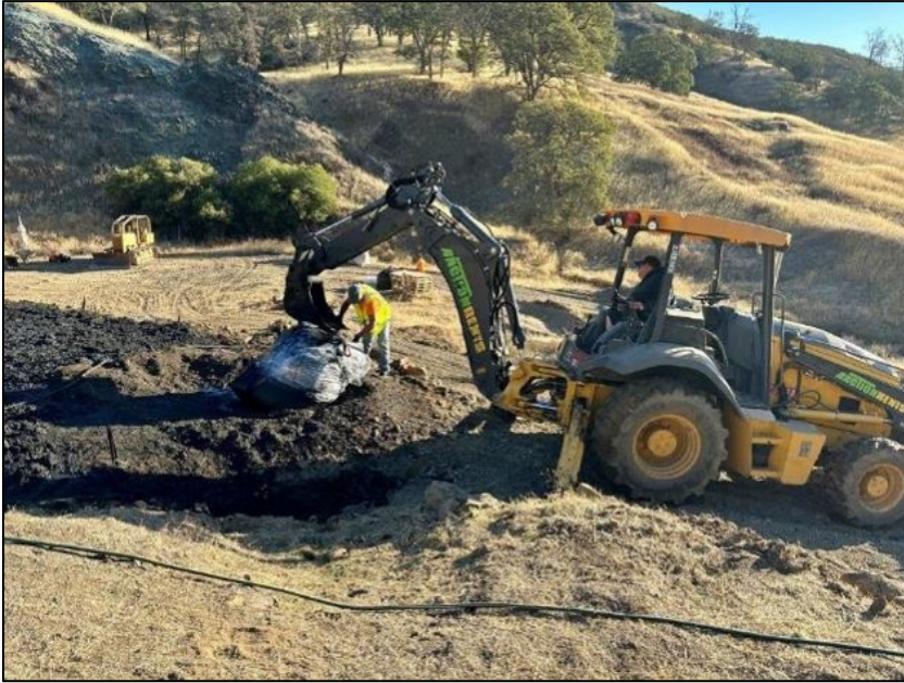
Figure S2: Site 2 photos