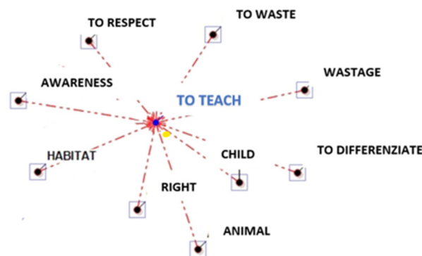
Figure 4. Co-occurrence graph for the lemma ‘to teach’.