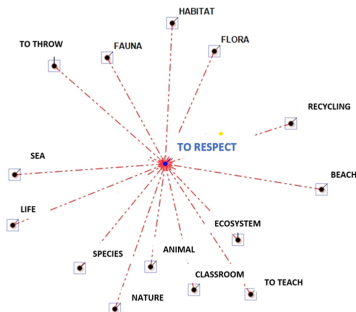
Figure 3. Co-occurrence graph for the lemma ‘to respect’.

to pupils; it is associated with several words describing different natural contexts (see Figure 3 and Table 2), such as ecosystem (cosine coefficient 0.44), fauna (cosine coefficient 0.38), flora (cosine coefficient 0.37) and beach (cosine coefficient 0.31).