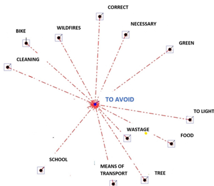
Figure 2. Co-occurrence graph for the lemma ‘to avoid’.

Regarding our sample, the most cited word is the verb ‘to avoid’; the co-occurrences are shown in Figure 2, where the keyword is in the middle and all the associations are represented in graphical terms. More specifically, the smallest is the distance between two linked words and the strongest is the frequency of co-occurrence. The relation is explained by the cosine coefficient, i.e., the association index (Lancia 2012), as detailed in Table 2.