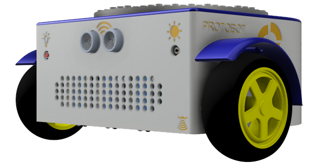
Figure 1. FossBot.

the robot can be replaced at a low cost in case of fault since they are electronics that can be easily found in the market. Since its frame is built from plastic, it is easy to print in a 3D printer, and even better it is possible to redesign it to support more activities. The upper part of the frame has been designed to allow attaching a LEGO-compatible base and can be modified to allow more types of constructions to be built on top. Figures 1 and 2 illustrate the FOSSBot and its interior and top, respectively. Moving on, FOSSBot contains most of the sensors and actuators found in commonly used educational robots, as has been shown in Table 1.