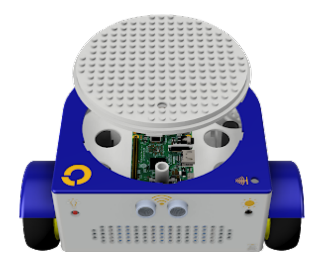
Figure 2. FossBot Interior and top.

The robot is based on a Raspberry Pi microprocessor but can be replaced or expanded with other microcontrollers like Arduino, BeagleBone, etc. The microprocessor enables the robot to run in three modes such as no-coding, block-based, and notebook coding modes. The connection to the robot is wireless, using WiFi (see Figure 3). The no-coding mode is suitable for children who are beginning to demonstrate the robot's abilities using a user interface (UI). The block-based coding mode is based on Google Blockly software which is open source. This mode allows learners from primary school to give instructions to the robot, perform different tasks, and interact with the robot's sensors and actuators. Users who are good at coding can program the robot using a Jupyter Notebook in the Python programming language. In addition, experienced users can connect to the robot and use its core library directly using the Python programming language.