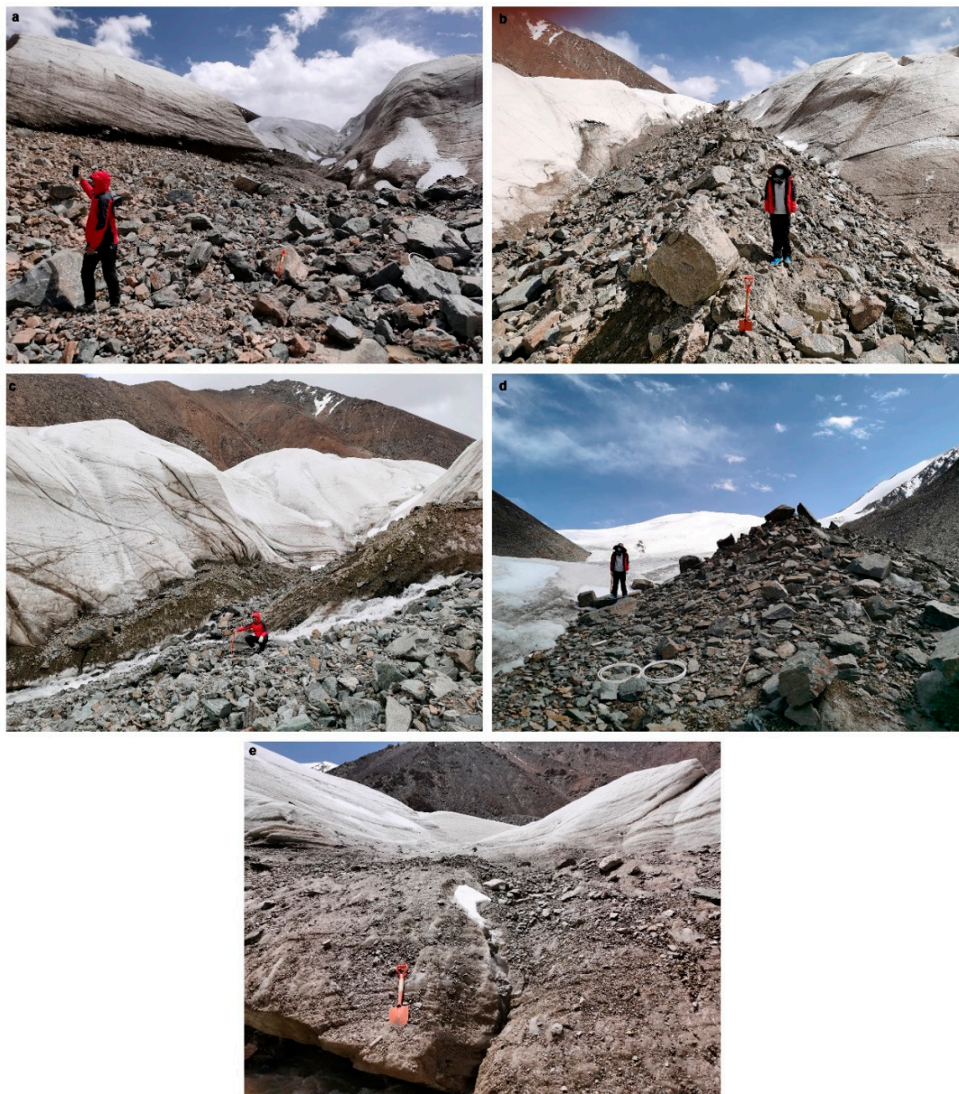
Figure S1. Exposed englacial debris in five zones A-E (a-e, respectively; taken on summer 2022).