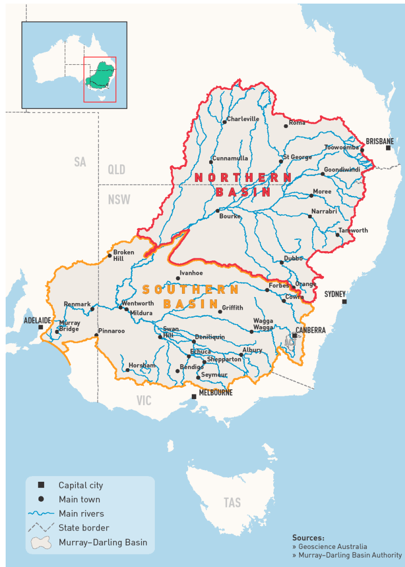
Figure 1. Map of the Murray Darling Basin in eastern Australia, showing the location of both the northern and southern Basin [3].

are principally red-brown earths [5], chromosol or sodosols [6]. The prolonged Millennium Drought which occurred from 1997 to 2009 saw major reductions in rainfall across south-eastern Australia and record low inflows into storages. In this region, a drought is defined as a prolonged, abnormal dry period when the amount of available water is insufficient to meet normal use [7].