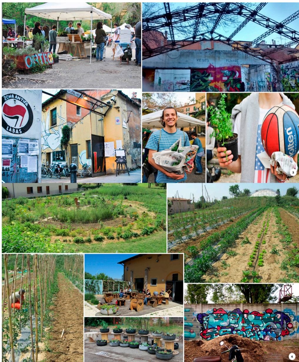
Figure B1. Pictures of urban horticulture projects in Bologna selected as case studies. (1) Flowerbeds along streets and squares: (a) “I Colori dell’Orto”, Piazza dei Colori, 27; (b) “Gli Orti della Fornace”, Via della Beverara, 123; (c) “Aiuola Donata”, Piazza San Donato, 1; (2) Balconies and rooftops: “GreenHousing”, Via Antonio Gandusio, 12; (3) Abandoned / squatted public buildings: “Labàs”, Via Orfeo, 46; (4) Abandoned neighbourhoods: “OrtoCircuito”, Via del Battirame, 13.