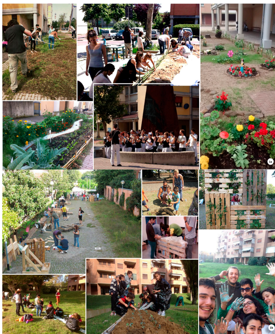
Figure B1. Cont.