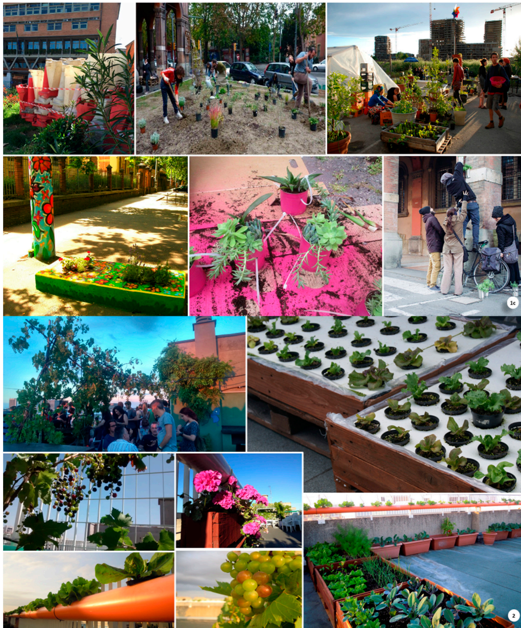
Figure B1. Cont.