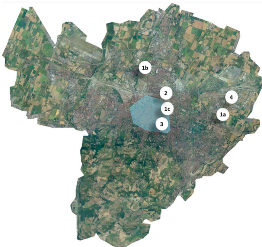
Figure 2. Location of the case studies (city centre identified in light blue). (1) Flowerbeds along streets and squares: (1a) “I Colori dell’Orto”, Piazza dei Colori, 27; (1b) “Gli Orti della Fornace”, Via della Beverara, 123; (1c) “Aiuola Donata”, Piazza di porta San Donato, 1; (2) Balconies and rooftops: “GreenHousing”, Via Antonio Gandusio, 12; (3) Abandoned buildings: “Làbas”, Via Orfeo, 46; (4) Abandoned neighbourhoods: “OrtoCircuito”, Via del Battirame, 13.

Case studies include both bottom-up and top-down initiatives, where citizens either grew the activities independently or were invited to participate in a multi-stakeholder project, respectively. While top-down activities were lead and supported by the local government, bottom-up ones usually challenged the established power relations between administration and society. Stakeholders involved are the Municipality of Bologna, the University of Bologna and a variety of other institutions (e.g., Cooperatives, associations, research centres). The six experiences are distributed over the administrative borders of the city (Figure 2).