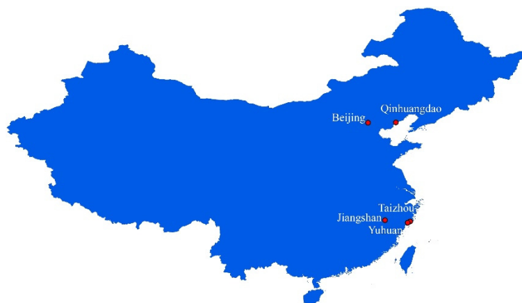
Figure 1. Locations of the four selected cities.

There are four cities included in the case studies. Four cities were selected, based on the criteria of (1) willing to participate in this research; (2) being able to provide necessary data; and (3) having developed its low-carbon sustainable development strategies and plan. The four cities are indicated in the Figure 1.