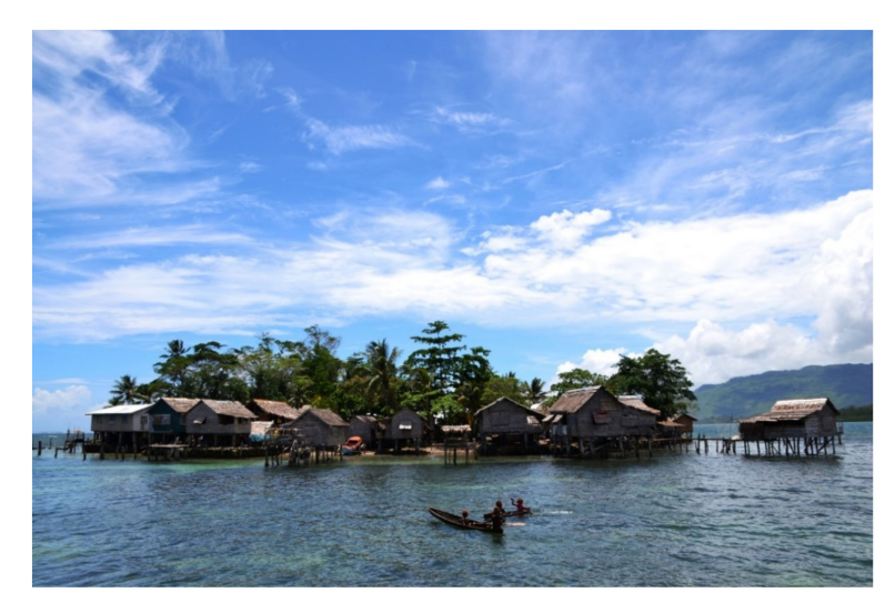
Figure 3. Funafou Island in Lau Lagoon (J. van der Ploeg, 2015).

such as Sulufou, Funafou, Foueda, and Tauba, are relatively large (>1 ha), and are densely populated. Others are very small (<100 m<sup>2</sup>). Some islands are built as extensions of natural islands or rock outcrops in the lagoon. Others are constructed in the mangroves by constructing coral rock walls, often more than 3 m high, and filling the enclosure with gravel and sand. In most cases, these islets are just above the high-water mark (<30 cm), and most houses are constructed on stilts (see Figure 3).