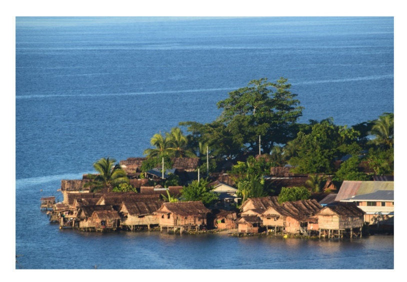
Figure 5. Lilisiana in Langalanga Lagoon.

such as Lilisiana, have grown rapidly over the past fifty years (see Figure 5), and many young and educated people migrate to Honiara in search of a better life.