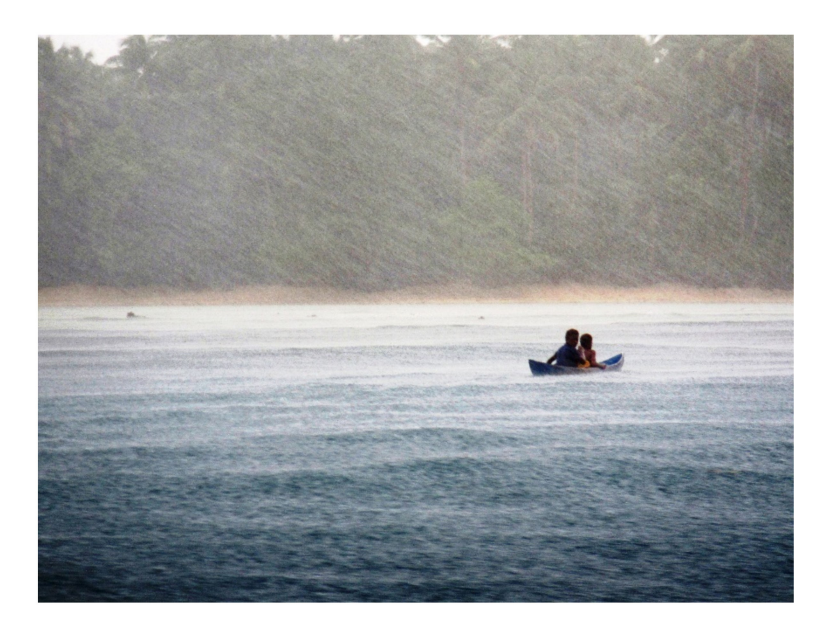
Figure 10. Children on their way to school (J. van der Ploeg, 2016).

Heavy rains can make the daily canoe trip to school hazardous for children (see Figure 10). During the koburu season, women have difficulties travelling to the market. Many wane asi have therefore opted to relocate to the mainland.