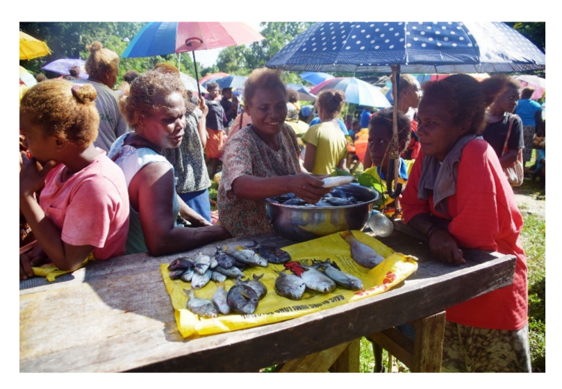
Figure 2. Women barter fish for root crops in Lau Lagoon.

The distinction between wane asi (saltwater people or to'aiasi) and wane tolo (forest people or to'aitolo) is a salient feature of human ecology in Melanesia [17,18]. The wane asi are fishers who barter fish for root crops and vegetables with the wane tolo, shifting cultivators who inhabit the forested interior of Malaita (see Figure 2). This distinction is not absolute. Nowadays, many wane asi maintain agricultural plots and many wane tolo are fishing, and intermarriage is common [19]. Nonetheless, many communities continue to identify themselves as wane asi: The livelihoods, worldview, and identity of these people revolve around fishing and the sea.