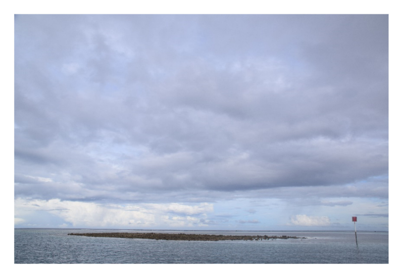
Figure 7. Rarata Island in Langalanga Lagoon.

9 m (!) storm surge that flooded the artificial islands in Langalanga in 1966 [59]. A year later, in 1967, cyclone Annie destroyed houses and coconut plantations in North Malaita, and in 1972, tropical cyclone Ida caused massive devastation in the province and encouraged landward migration [35]. Several artificial islands in Langalanga Lagoon, such as Rarata Island, were permanently abandoned after cyclone Namu in 1986, the worst tropical cyclone to have affected Solomon Islands on record (see Figure 7). It illustrates that tropical storms have always been an integral part of life for coastal communities in the archipelago [60]. In fact, cyclones also create opportunities: The village of Abitona in East Malaita was built on a sandbank created by a severe cyclone in the 1920s. The new land proved attractive to settle on, particularly as there were no existing land claims. Nowadays, the village is flooded by king tides in December and January, but whether this is a new phenomenon or caused by climate change, soil compaction, the cutting of mangroves, or a combination of these factors, remains unclear.