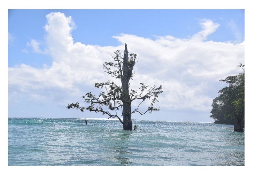
Figure 8. Rapid subsidence on the southeast coast of Malaita.

the Anglican Church of Melanesia fostered an agreement with wane tolo land owners, built a church, and encouraged the wane asi to settle in the new village [30]. Interestingly, before settling on Walande Island, people lived on Namo Island, which was abandoned in the 1930s after a tsunami (see Figure 9). And in the mythical past, the ancestors of the people of Walande lived on a small off-shore island called Hile, which was, according to oral history, also destroyed by a tsunami (also see Nunn et al. on the disappeared Pororourouhu Islands off the coast of South Malaita [71]). Other coastal areas on Malaita are also subject to geological upheaval: Gold [72], for example, reports that two severe earthquakes in October 1931 destroyed several artificial islands in Bina Harbor in Langalanga Lagoon. In fact, fear for an impending tsunami or cyclone is an important motivation for many wane asi to move from the artificial islands to the mainland.