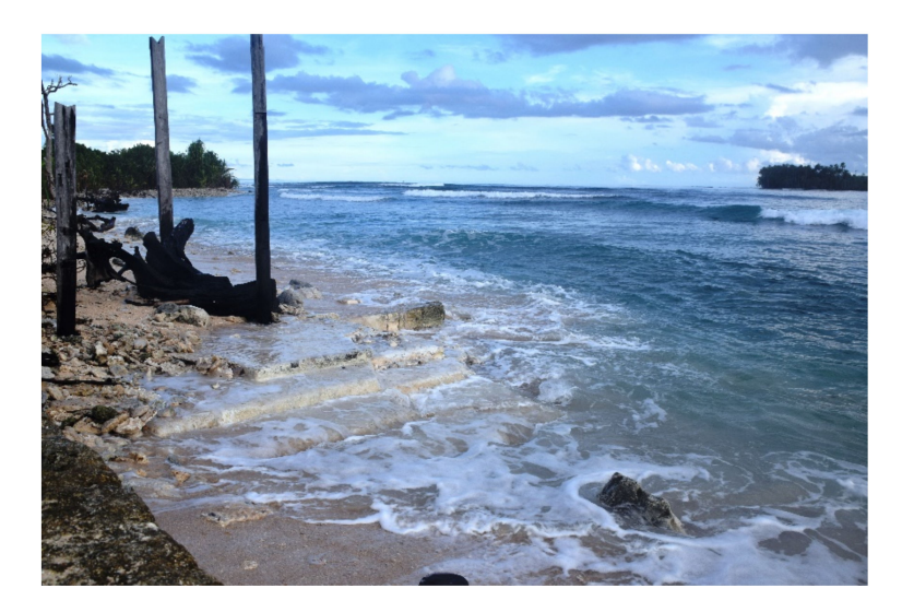
Figure 4. The remains of the Anglican church of Fanalei (J. van der Ploeg, 2018).

A closely affiliated ethnic group are the Kwai, who live on two densely populated islands on the East coast of Malaita: Kwai and Ngongosila. People here speak Guala'ala'a, which was used as a trading language along the coast [21]. Reliable census data is lacking but it's estimated that around 900 people live in these two communities. The saltwater people from Kwai and Ngongosila, and several other small artificial islands scattered around Uru Harbor, trade fish with the Kwaio people from the uplands. Ngongosila was settled in 1955 when the South Sea Evangelical Mission built a church on the island [29].