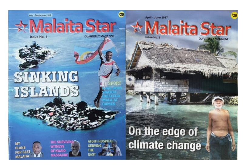
Figure 1. The sinking islands of Malaita (Malaita Star, 2016, 2017).

Similar claims are regularly made in science, policy, and development discourses. There is broad scientific consensus that people on low-lying islands in the Pacific are highly vulnerable to future climate-induced sea-level rise, and that there is an urgent need to invest in adaptation mechanisms [2,3]. But little is known about how local people in remote rural areas, such as Malaita, perceive and deal with climate change [4,5]. Rebecca Monson and Joseph Foukona [6] write in an edited volume on climate displacement that the wane asi in Lau Lagoon increasingly have to cope with changing wind patterns, extreme weather events, and coastal erosion: