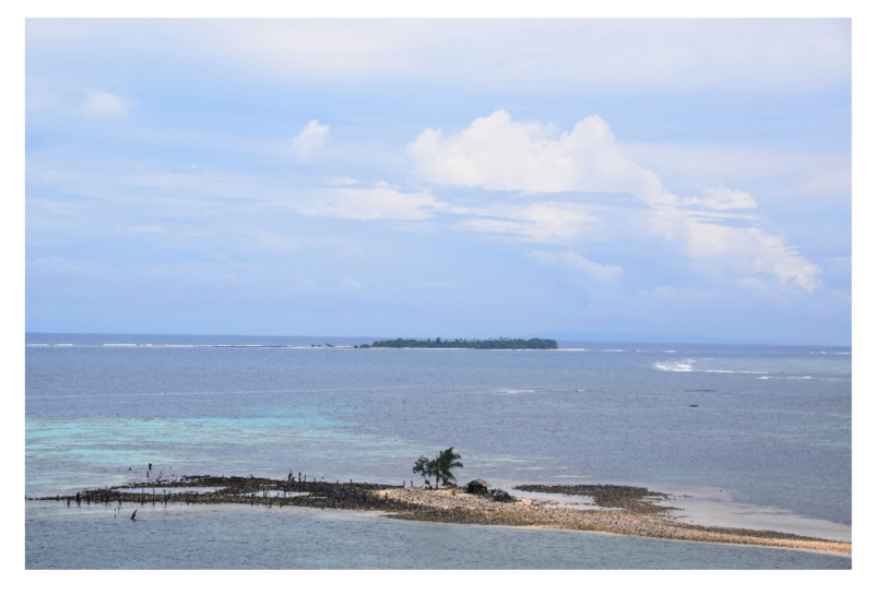
Figure 9. Walande Island on South Malaita (J. van der Ploeg, 2018).