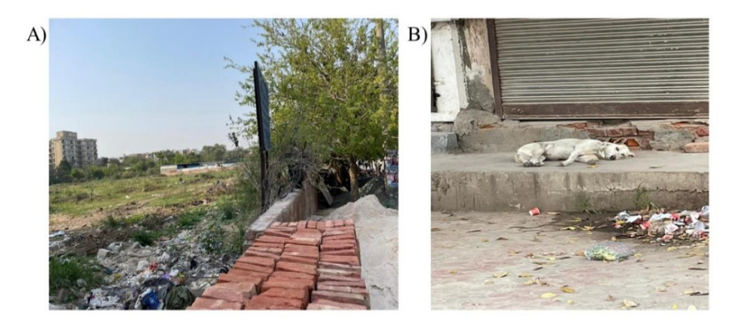
Figure 2. (A) Garbage dump in the empty land near the incident site. (B) The stray dog which was exposed to the laboratory-confirmed rabid dog during the incident.

The resident who witnessed the incident recalled a significant unprovoked exposure (category III bite) in one case of a 7-year-old girl on the evening of 20 February 2022. The interviewee took the team to the animal bite victim's (ABV) house. The team visited this ABV's home and interviewed the girl's mother. The mother noted that there were multiple deep wounds with profuse bleeding on the girl's right thigh (Figure 3).