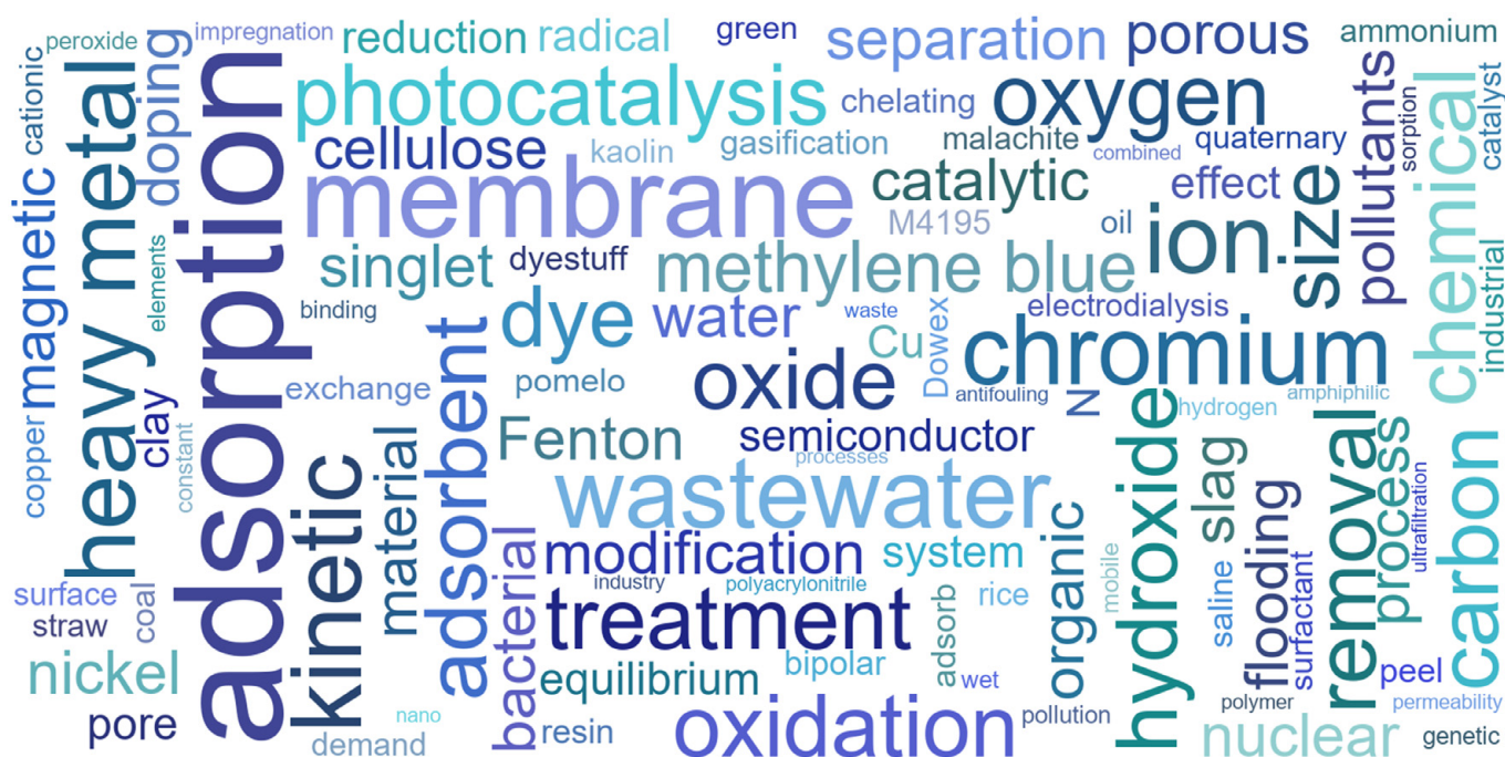
Figure 1. Keyword cloud of the 34 papers in the Special Issue.

Wastewater treatment is often considered a “rescue” step in various processes, with cost remaining at its core. Therefore, the focus should also be on the economy while considering treatment efficiency.