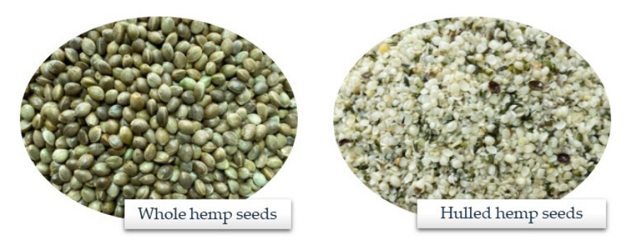
Figure 2. Hemp seeds (Cannabis sativa L.).

of the hemp seeds (Figure 2), as detailed in Table 1, offer measurable characteristics that contribute to defining the species. However, they do not provide information about the plant's maturation process [13,14,29].