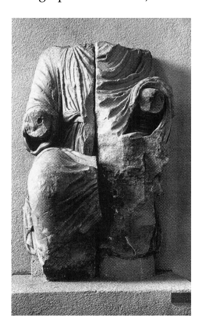
Figure 5. Headless statue of Frederick II, sculpture, from the façade of the Capua Gate, 1234–1247. Capua, Museo Provinciale Campano. Image published in [12] (Figure 24).

iconographic program of the gate. The promulgation of the Liber Constitutionum was a cause of friction between Frederick II and Pope Gregory IX due to the fact that the latter opposed the royal ius condende legis (about that, see [45]). Nevertheless, it is only in the period between 1239 and 1250 that the relationships between the pope and the emperor degenerated into a bitter conflict and, moreover, the message of the Capua Gate seems to be addressed more to the Sicilian subjects and foreign visitors of the lands of Southern Italy than the papacy (about that, see again [12] (pp. 99–100) with more information and bibliographic references).