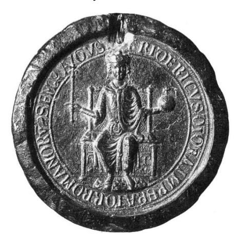
Figure 1. Seal of Frederick II of Hohenstaufen as emperor, impression on red wax, February 1224. München, Bayerische Hauptstaatsarchiv, diploma KS. 664. Image published in [12] (Figure 18).

bulls and coins was capillary and widespread, and, for this reason, the royal image could reach a large number of subjects (about that, see: [12] (p. 89). About Frederick II's chancery, see in summary: [19,20]).