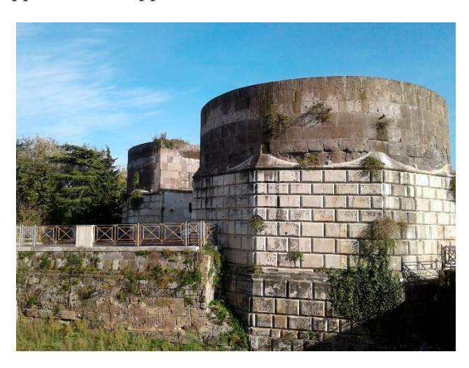
Figure 4. Capua, bridge of the Volturno River, Capua Gate, current state.

the theoretical conception of power presented in the Prooemium of the Liber Constitutionum , a collection of laws enacted by Frederick II in Melfi in September 1231 (about that, see: [12] (p. 99) with more details and bibliographic references. About the aspects of Frederick II's political ideology in particular, see: [40] (passim), [1] (pp. 211–239), [2] (pp. 171–179), [41] (pp. 82–96), [9] (pp. 564–579), [42]. About the Liber Constitutionum , see in summary [43]).