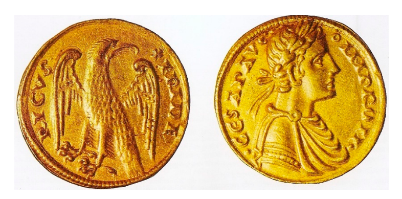
Figure 3. Augustale of Frederick II of Hohenstaufen, obverse and reverse sides of a gold coin, 1231–1250. Naples, Museo Archeologico Nazionale, Collezione Fiorelli, no. 1127. Image published in [12] (Figure 23).

This coin is made with gold at 20.5 carats, weighs between 5.24 and 5.29 g (between 2.63 and 2.65 g in the mezzo augustale version), and has a diameter of 20 mm. It was directly commissioned by Frederick II and was minted in Messina and Brindisi from 1231 to 1250. On the reverse side, FRIDERICVS is inscribed and the image of an eagle, the symbol of the empire, is found. On the obverse side, IMP(ERATOR) ROM(ANORUM) CESAR AVG(VSTVS) is inscribed and the royal image is found. The king is in half bust, in profile position, and he has short hair and is clean shaven. Moreover, he wears a paludament and a laurel wreath as well as an ancient Roman emperor (Figure 3). Iconographic affinities have been highlighted with the coins of the Carolingian Emperors Charlemagne and Louis the Pious but also of the Roman Emperors Constantine and, above all, Augustus. Certainly, symbols of power, attires, and physical features perfectly imitate that of an ancient Roman emperor (about the augustale, see: [22] (Volume 18, p. 196), [24], [1] (pp. 209–210 and pp. 705–711), [25], [23] (p. 195), [14] (pp. 73–74), [26] (pp. 70–74), [5] (p. 272), [27], [9] (pp. 634–636), [28], [17] (Volume 2, pp. 54–56, cards III.A.2–6)).