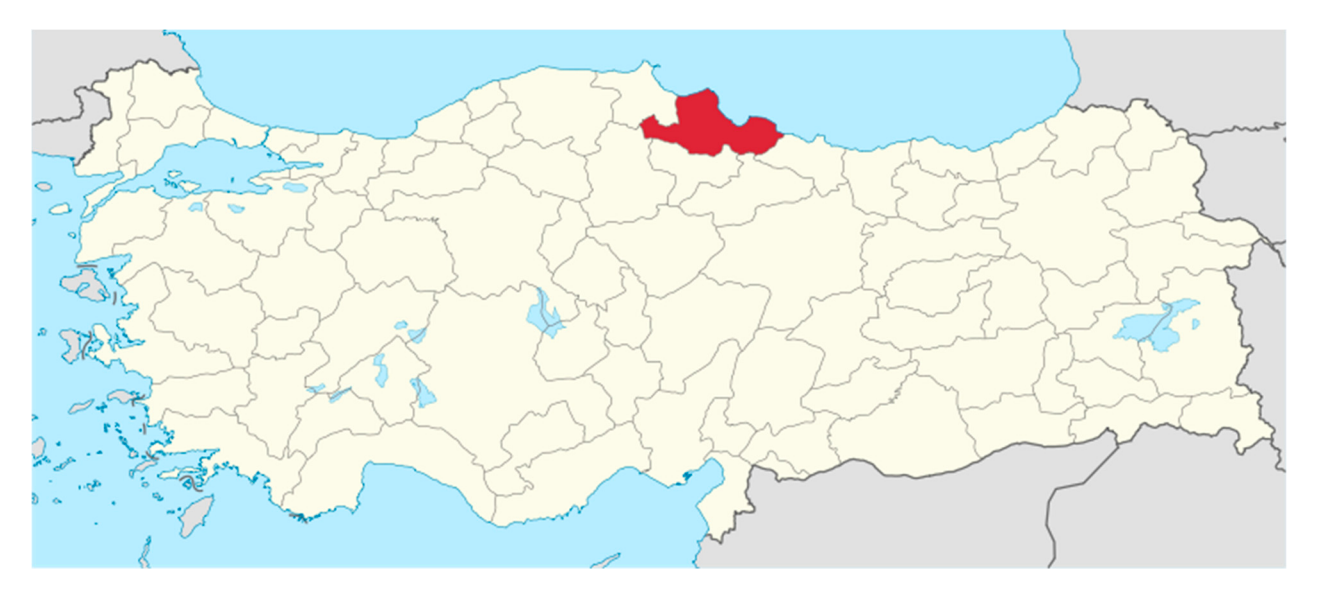
Figure 1. Samsun and its location in Turkey.

Samsun, located in the central part of the Black Sea Region of Turkey, is the most crowded and developed city of the region (Figure 1). Its population was 1,356,000 by the end of 2020 [10], and it is the 16th crowded city of Turkey. It is surrounded by the Black Sea in the north, Ordu city in the east, Tokat and Amasya in the south and Sinop and Çorum cities in the west. The city has an area of about 9725 km<sup>2</sup>, and 45% of this area is mountains, 37% plateaus and 18% plains.