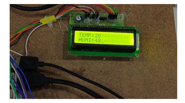
Figure 2. Photograph of the LCD screen showing real-time temperature and humidity readings.

The results of the climate monitoring of block carbon detection using Raspberry Pi with machine learning are shown in Figures 2–4.