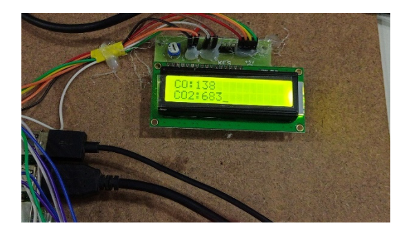
Figure 3. Photograph of the LCD screen showing CO and CO<sub>2</sub> values.