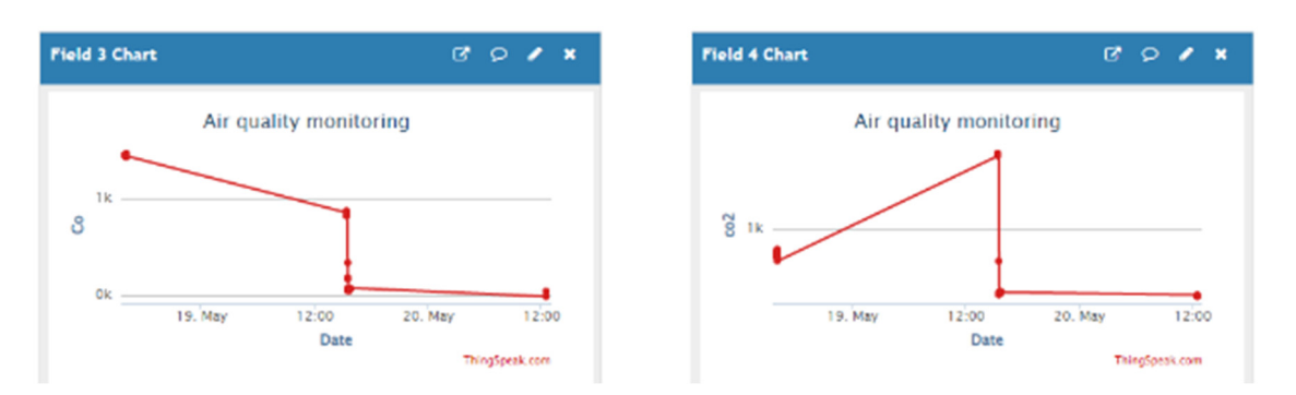
Figure 4. The sensor values are uploaded to a Thing speak server (IOT).