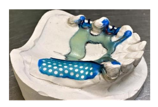
Figure 11. RPD modeled in wax.