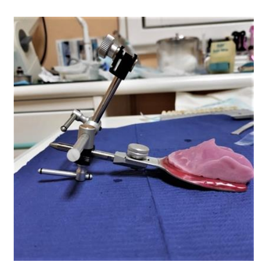
Figure 17. Spatial position of the upper jaw detected by means of the face bow (Artex).