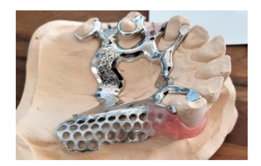
Figure 13. Structure with nylon clasps.

In the hybrid procedure, the second analog model was scanned using a laboratory scanner (Neway Open Tech 3D) to create the correspondent digital model, then the CAD modeling of the removable partial denture (RPD) was realized (Figure 14). The selective laser melting machine was then connected to the computer to realize the skeleton structure through the application and the melting of hundreds of chrome–cobalt dust layers (Figure 15). The structure was finalized by applying some aesthetic clasps made of nylon (Figure 16).