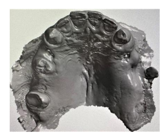
Figure 8. First digital impression.

Two models were created from the impression: the first one was made of gypsum starting from the impression tray loaded with alginate, whereas the latter was made of resin through the 3D printing methodology and obtained starting from the impression acquired with an intraoral scanner (Omnicam 2.0 Dentsply Sirona). The models were then studied at the dental parallelometer and used to perform an accurate study of the clinic case to evaluate the undercuts amount and the most adequate prosthetic design for this clinic case. At the second appointment, using a cylindrical diamond cutter, the dental elements 1.3–1.5–1.7–2.3 supposed to accommodate the supports were prepared (this was