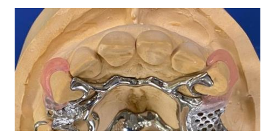
Figure 16. Complete structure with frontal clasps in nylon.