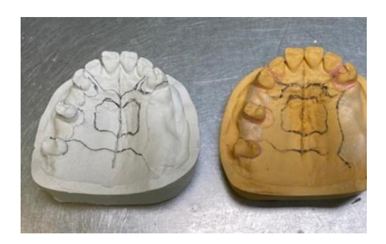
Figure 10. Duplication of the model.

The second impression was used to create a model on which the removable partial denture (RPD) was drawn and realized. In the analog procedure, the model (plaster type IV) was duplicated to create a second model made of refractory material (Figure 10) to be used as a base for the removable partial denture (Figure 11). Lost wax casting was then performed (Figure 12), and finally, the clasps made of nylon were realized (Figure 13).