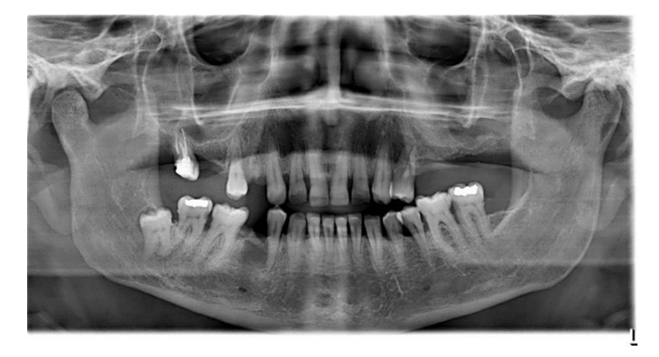
Figure 6. Orthopantomography.

Successively, the patient was informed about the situation and the different approaches that could be applied to restore the anatomy and physiology of her stomatognathic system. The treatment proposal was to adopt a prosthetic rehabilitation based on a partial prosthesis. This solution was both in line with the request of the patient to avoid any surgery, and with her wish to improve the masticatory function. A chrome–cobalt removable partial denture (RPD) was created, with some aesthetic clasps made of nylon (Valplast standard type III) in the anterior sectors. (Table 1. Case report comparison table)