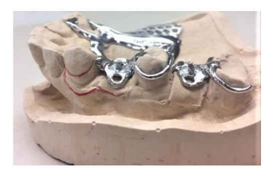
Figure 12. Chrome-cobalt structure.