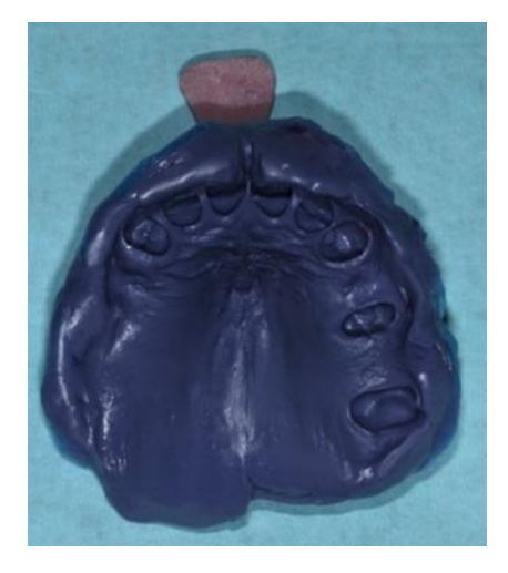
Figure 9. Second impression in polyether.

done by sinking the cutter about 5 mm, thus remaining in the enamel surface and ensuring adequate thickness for the supports). This procedure was necessary to ensure adequate accommodation and discharge of the occlusal maybe generated by chewing; in the same session, a second impression was detected by using an individual impression tray which was adequately edged and loaded with polyether (Impregum 3M) (Figure 9).