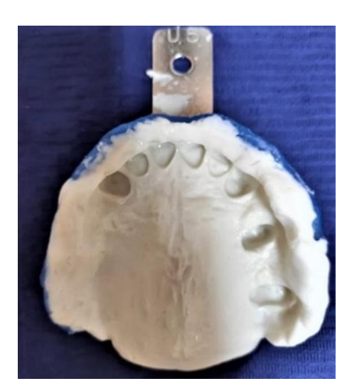
Figure 7. First impression in alginate.

In this clinic case, both analogic and digital procedures were adopted, so a first impression was obtained by using a standard impression tray loaded with alginate (Figure 7), and a second one was obtained with an intraoral scanner (Figure 8).