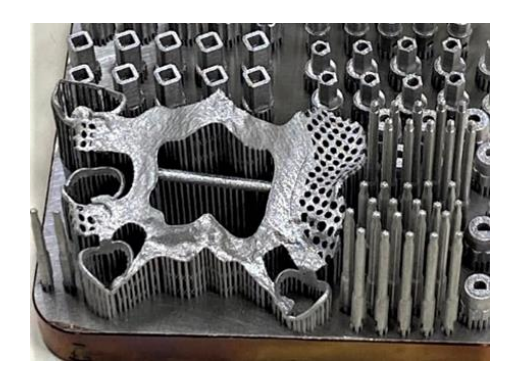
Figure 15. RPD after SLM.