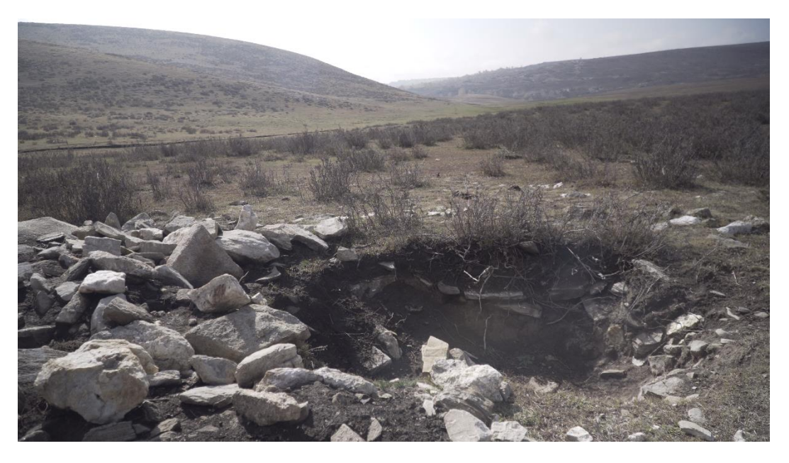
Figure 4. A recently looted (2016) Early Iron Age burial in the area of interest (Photo: Courtesy of T. Wallace).