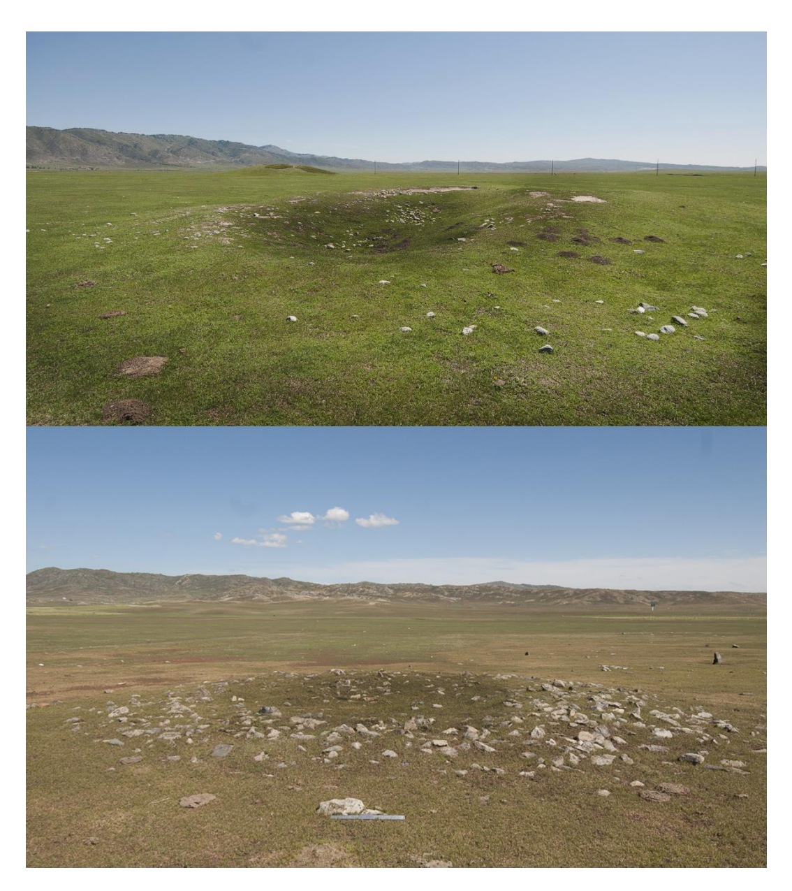
Figure 1. Two general types of Early Iron Age burials can be distinguished in the region based on the construction materials: ( upper ) Burial mounds built from soil and ( lower ) burial mounds built from stones. Both monuments are completely looted, hence the deep central depression.

that a burial mound is unlooted, since the complex taphonomics can lead to looting traces being substantially diminished.