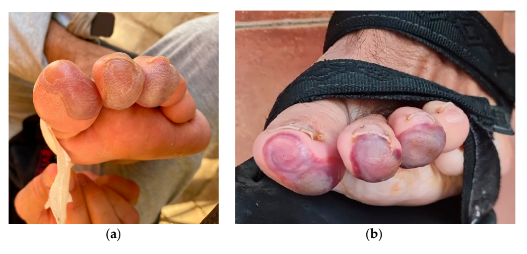
Figure 3. Appearance of the foot at seven days (a), and two weeks postoperatively (b).

Radiographic examination after one year following the second surgery showed signs of severe joint destruction compatible with MPJ resection arthroplasty with significant shortening of the first toe (Figure 5). The patient was treated conservatively with orthopaedic insoles.