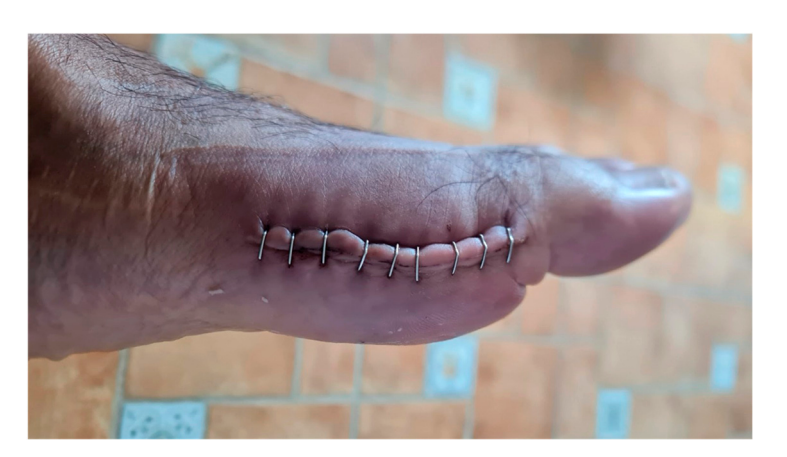
Figure 2. Postoperative appearance of the medial incision prior to staple removal.

The patient was reviewed to perform the first dressing change and surgical control a week after surgery, and the responsible nurse noticed blisters fade under pressure with pain in the ball of the first, second, and third toes compatible with partial-thickness burns (Figure 3a). The patient reported having suffered severe pain at the level of the toes in the operated foot and difficulty walking during the first three days after surgery. He reported that the pain did not subside with the prescribed medication (acetaminophen 650 mg every 8 h per os). After consulting with the surgeon, he was unaware of the circumstances that caused the injuries, and the nursing staff was urged to take care of the wounds for both the surgical incision and the burns. The injuries were initially treated by the patient at home with applications of povidone iodine antiseptic solution. After two weeks, the skin staples were removed from the medial incision, and adequate closure of the surgical incision could be verified. On the injured toes, the redness of the blisters was observed to fade under pressure (Figure 3b). At three weeks, rupture and desiccation of the blisters with epidermal necrosis areas were observed in the burns and surgical excision was performed. The local application of silver sulfadiazine was carried out every 48 hours until complete healing that was achieved at 7 weeks (Figure 4a,b).