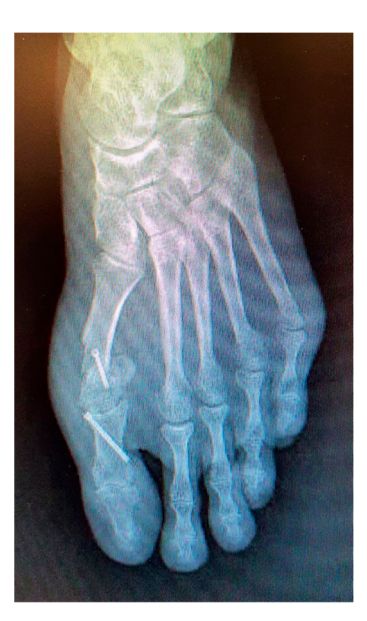
Figure 1. Postoperative radiological aspect of foot after the first procedure.

In May 2021, he underwent an operation to correct the hallux valgus deformity using chevron capital osteotomy and a proximal Akin procedure (Figure 1). The patient reported that a year later he had to be operated on again due to pain at the level of the first MPJ to remove the osteosynthesis material. The second surgery was performed outpatiently with epidural anaesthesia through a medial incision at the MPJ level (Figure 2).