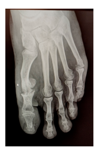
Figure 5. Postoperative radiography one year after the second procedure. Signs of severe joint destruction compatible with resection arthroplasty can be observed.