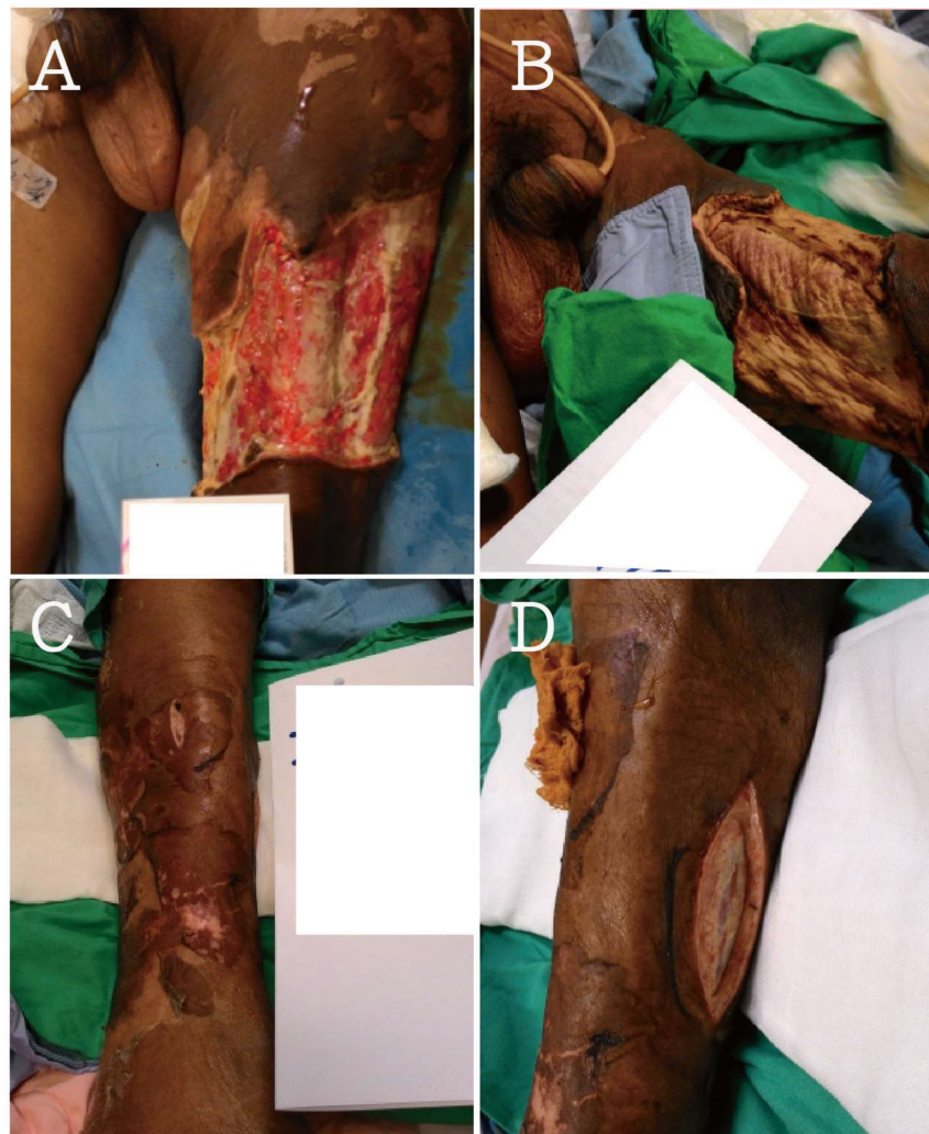
Figure 2. (A–D) The hyperpigmentation, desquamation and formation of bullae were noted on left thigh and lower abdomen. The yellowish pus was founded during fasciotomy.

The empiric antibiotics, Vancomycin, Imipenem and Ciprofloxacin, were administrated to cover Streptococcus , Staphylococcus , Aeromonas hydrophila , Vibrio vulnificus and Hemophilus influenzae . The hyperpigmentation, desquamation and formation of bullae on left thigh and lower abdomen was found (Figure 2A–D). Progressed necrotizing fasciitis was suspected and emergency surgical intervention was suggested. He received fasciotomy and debridement nine times. The culture reports showed Bacillus cereus growth in the blood and wound. After his infectious condition was stable, the skin grafting was done for left thigh and buttock wounds. Due to the stable condition, he received regular follow up at the outpatient department. An oral informed consent was obtained from the patient.