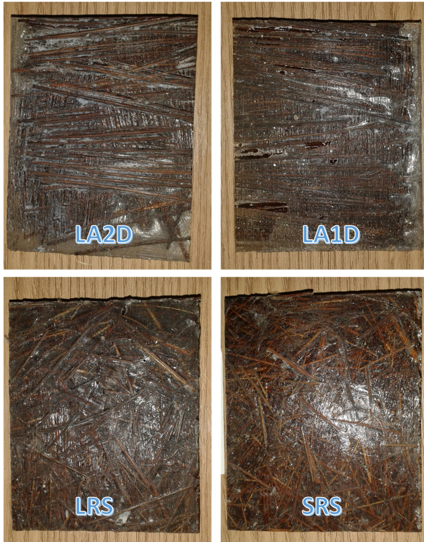
Figure S2. Macroscopic aspect of produced composites.